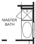
OPTIONAL MASTER BATH 36" X 60" TUB & 36" X 36" SHOWER