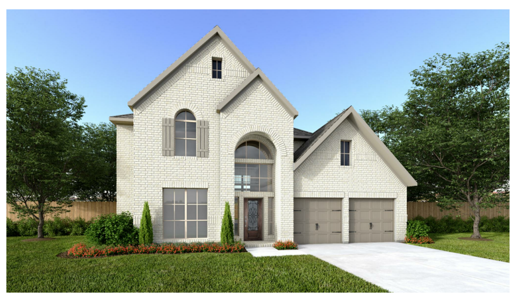
Design 2934W E-1