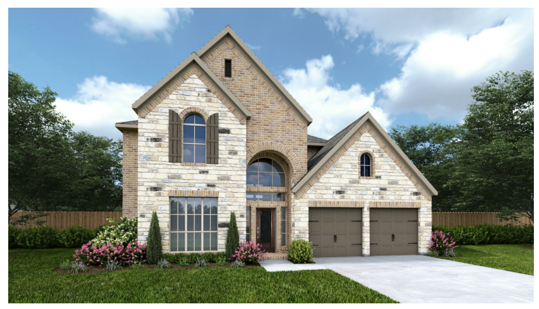
Design 2934W E-71

This design, as originally designed and prior to any changes you make, is estimated to yield approximately the number of square feet shown on page 1. All dimensions are approximate. Square footage may vary based on as-built dimensions, configurations, plan options and/or the method of calculation. Designs are not-to-scale, and are conceptual illustrations that may differ from construction plans or completed improvements. A design may depict features not available on all homesites or in all communities. Perry Homes reserves the right to make changes in plans and specifications, and to substitute material of similar quality. Prices, terms, promotions, plans, dimensions, features, options, amenities, elevations, designs, square footages, specifications, materials, and availability of homes or communities are subject to change with notice or obligation. All obligations will be governed by a written contract. This design does not constitute a commitment to build a particular floor plan or home in any given community. Some floor plans, option and/or elevations may not be available on certain homesites or in a particular community and may require additional charges. Please check with Perry Homes to verify current offerings in the communities you are considering. This rendering is the property of Perry Homes, LLC. Any reproduction or exhibition is strictly prohibited. © Perry Homes, LLC 2019