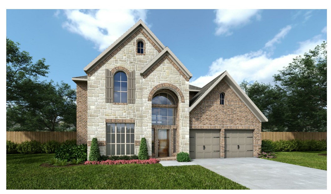
Design 2934W E-70