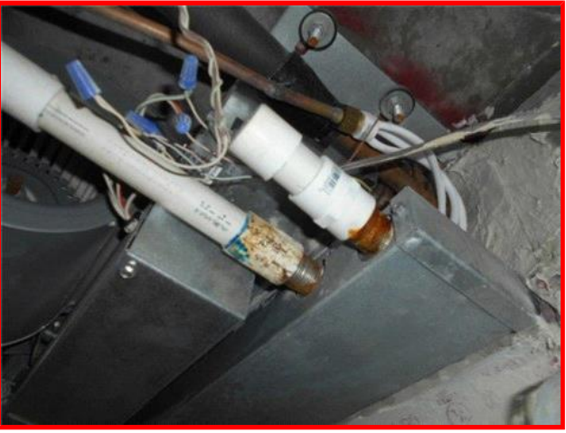
Inoperable A/C Unit