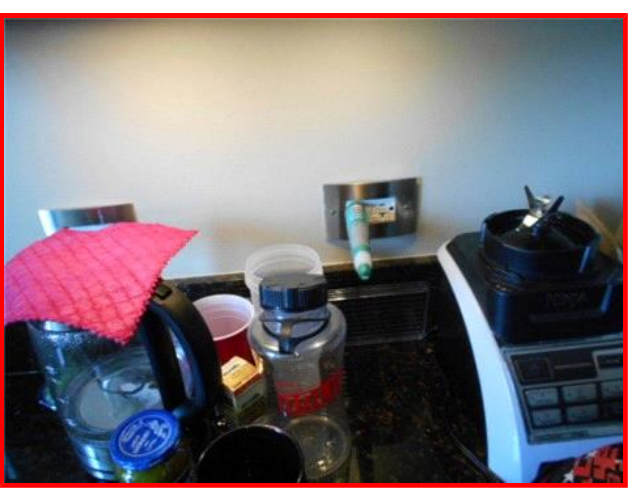
Open Neutral at Kitchen Outlet