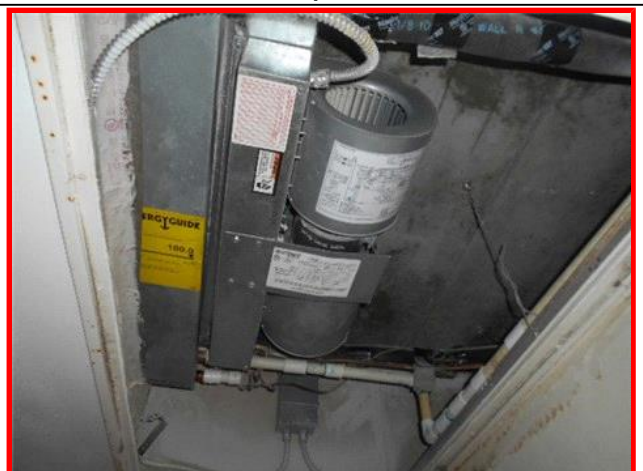
Inoperable A/C Unit