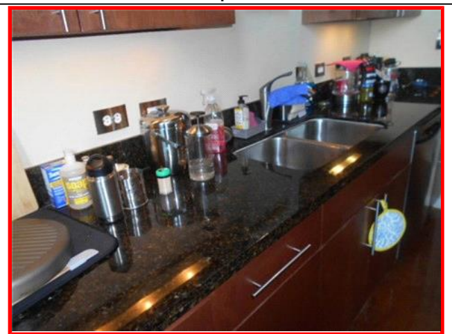
Missing GFI Protection at Kitchen Counter Outlets

*** Note: pictures with a RED border indicate a potential hazard, problem or defect ***