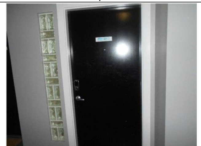
Front Entry Door