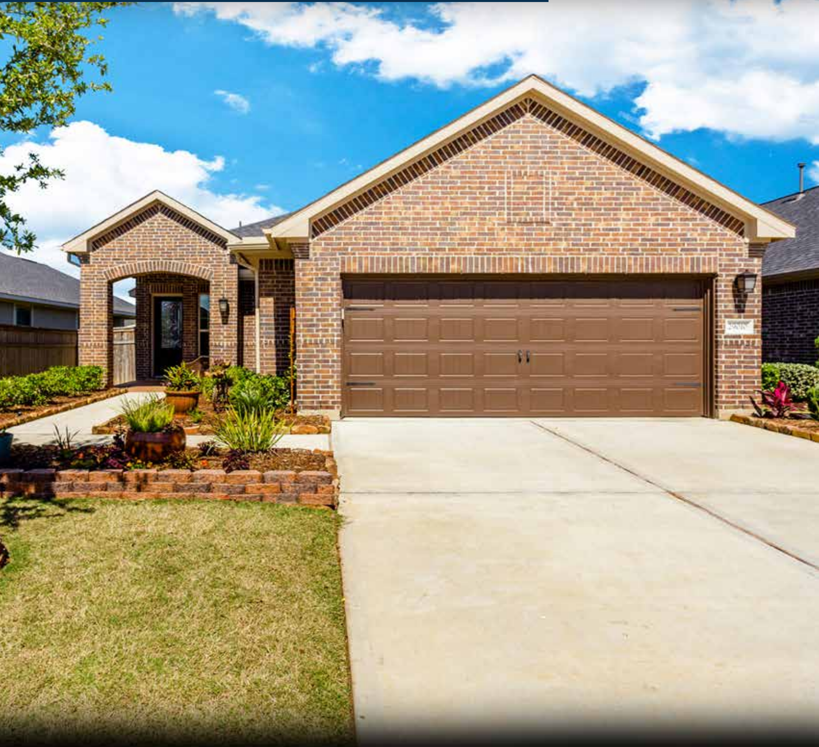
29010 Turning Springs • Cross Creek Ranch