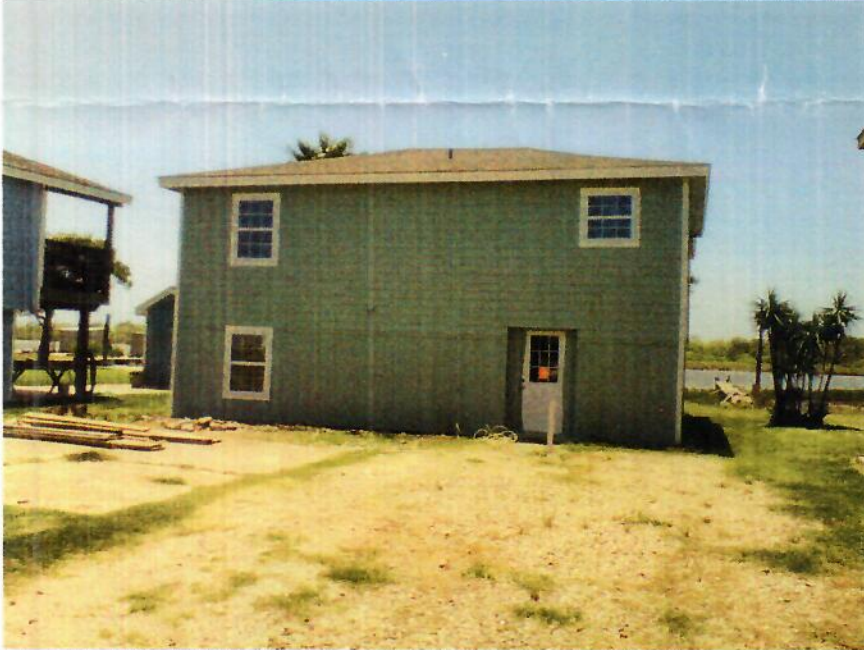
FRONT VIEW (5-24-11 JB/JE/FJS JOB# 9168)

If using the Elevation Certificate to obtain NFIP flood insurance, affix at least two building photographs below according to the instructions for Item A6. Identify all photographs with: date taken; "Front View" and "Rear View"; and, if required, "Right Side View" and "Left Side View." If submitting more photographs than will fit on this page, use the Continuation Page on the reverse.