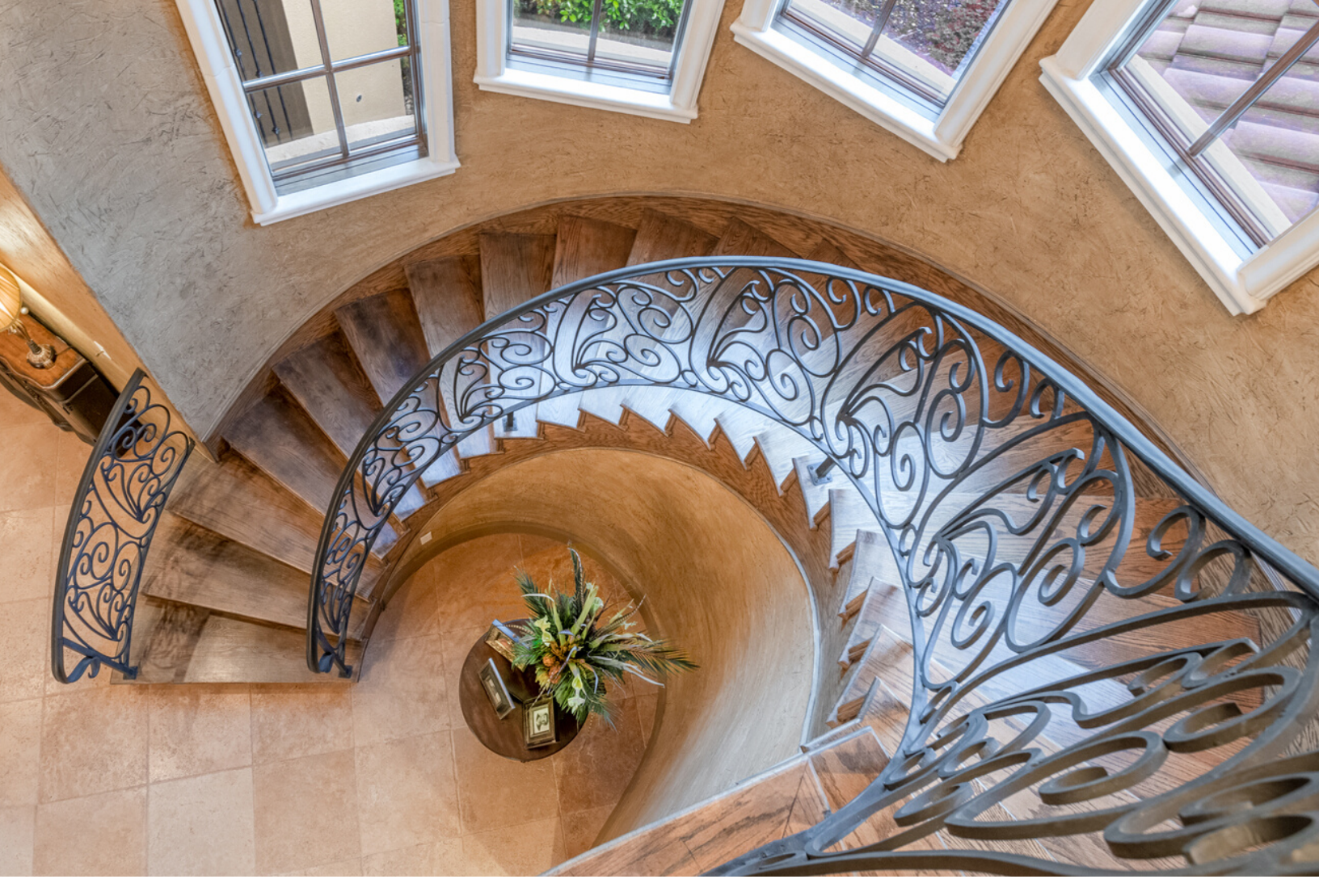
GRAND ENTRANCE / GAME ROOM / MEDIA ROOM