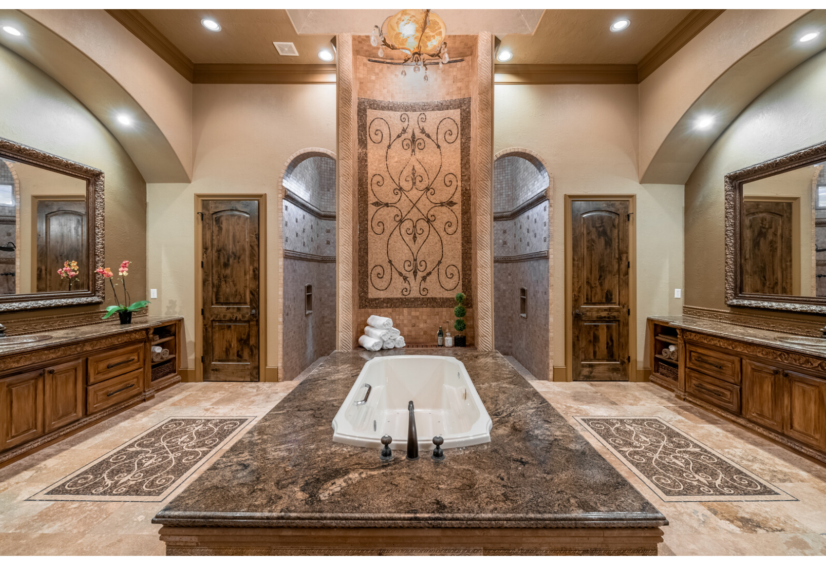
EXQUISITE 1ST FLOOR MASTER SUITE

The spacious master suite is the perfect retreat, soak in the spa-inspired master bath or lounge in your master suite next to a cozy fireplace and separate sitting area. Around every corner of this luxurious sanctuary you'll be mesmerized by intricate custom craftsmanship and stonework.