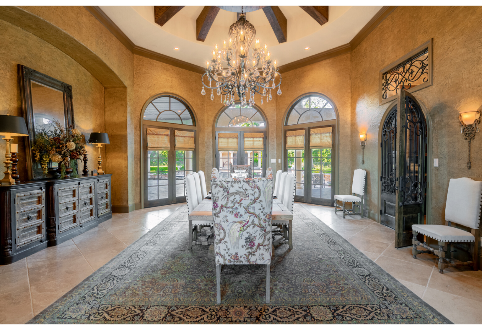
FORMAL DINING/FORMAL LIVING/KITCHEN/FOYER

Elegant and inviting spaces inside and out allow you to host any event from an intimate dinner to a sensational gala. Formal living and dining with 1,000+ wine room, a kitchen made for a chef, theatre and game room, caterer's kitchen, gym and beauty room, and a backyard oasis with outdoor kitchen, a gorgeous heated pool, and private casita.