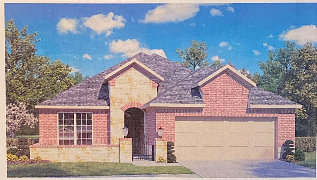
✦ Elevation J