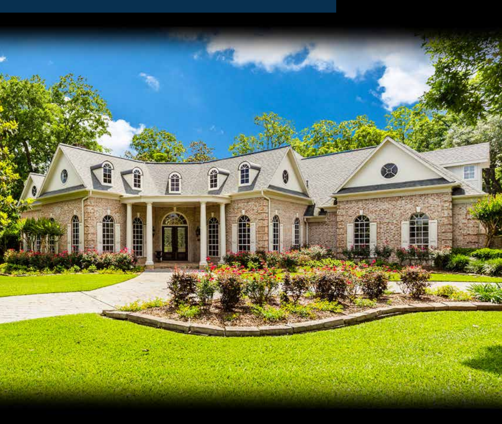
4918 Westerham Street • Weston Lakes