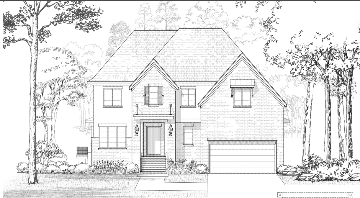
3747 Tartan Lane