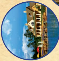
THE LAKE CLUB