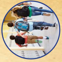
CLARK INTERMEDIATE SCHOOL TO OPEN 2018