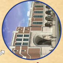
GRAND OAKS HIGH SCHOOL TO OPEN 2018