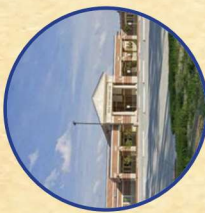
BIRNHAM WOODS ELEMENTARY