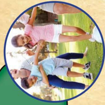
SENOVA RIDGE PARK