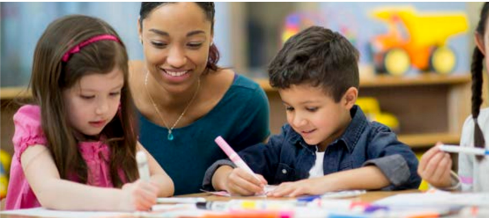
PROPOSED HOLCOMB FAMILY YMCA