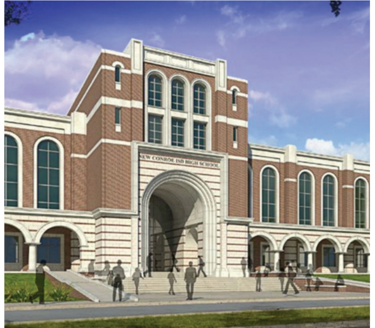
GRAND OAKS HIGH SCHOOL – FALL 2018