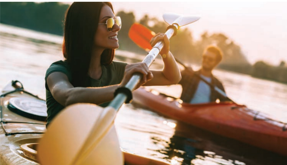
LAKE HOLCOMB – 100-ACRES