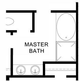
OPTIONAL MASTER BATH