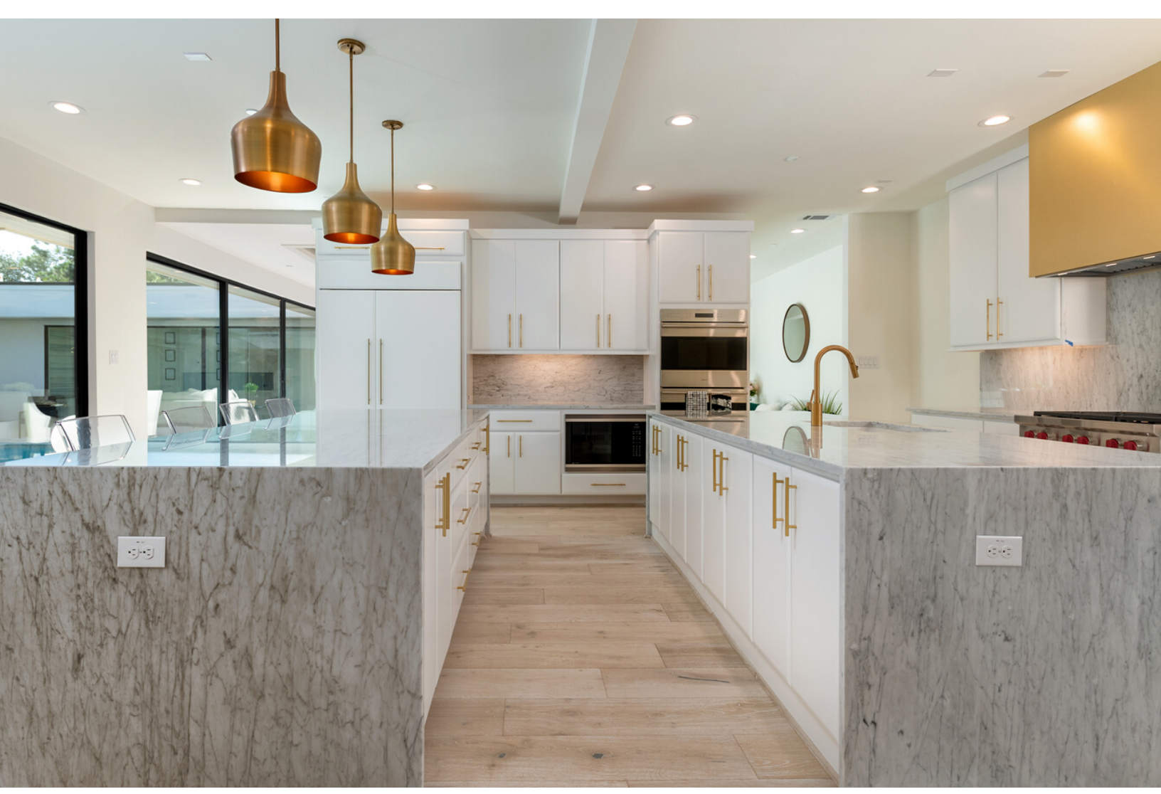
CHEF GRADE KITCHEN/ FAMILY ROOM

The open concept floor plan of the kitchen and lounge merges natural light and space, creating an ideal area for intimate gatherings of friends and family. Double islands with carrara marble waterfall counter tops provide considerable counter space and are coupled with chef-grade appliances creating an atmosphere where cooking is transformed from an everyday task into a celebration of connection.