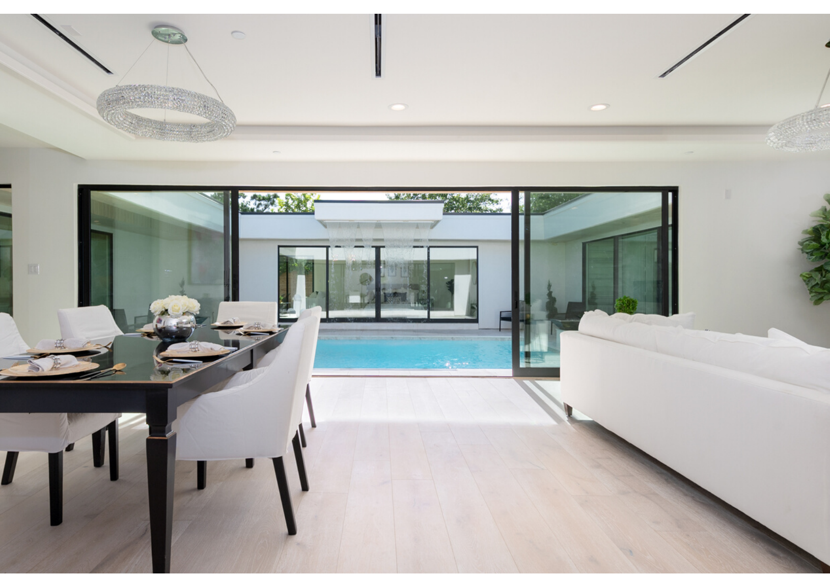
FORMAL DINING/FORMAL LIVING

In the formal living and dining room, the simple form of circular chandeliers highlight the inverted ceiling and add dimension to the space. Extending the length of a wall, the stacked masonry surrounding the fireplace provides texture and a visual design element. Large sliding glass doors open to the courtyard where gentle showers from the rooftop waterfall descend into the pool, creating a soothing whisper of sound.