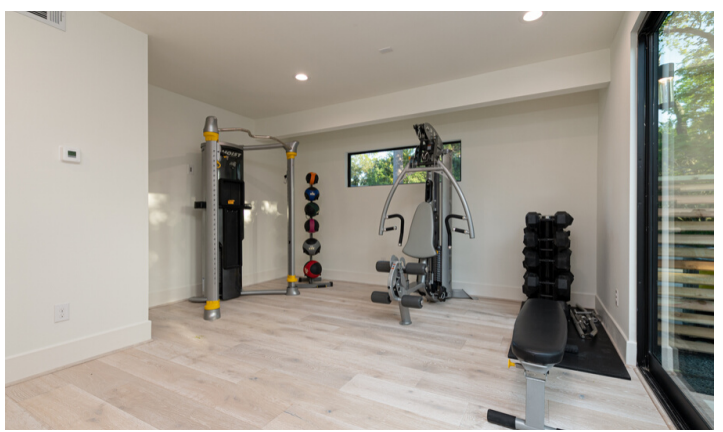
MEDIA ROOM/SECONDARY PRIMARY/OPTIONAL GYM

In Memorial Villages, homes of substance define the area. The city is deed-restricted and maintains its own police and fire departments as well as award-winning schools. Convenient to The Galleria, where the largest shopping center in Texas puts upscale stores and world-class dining within easy reach