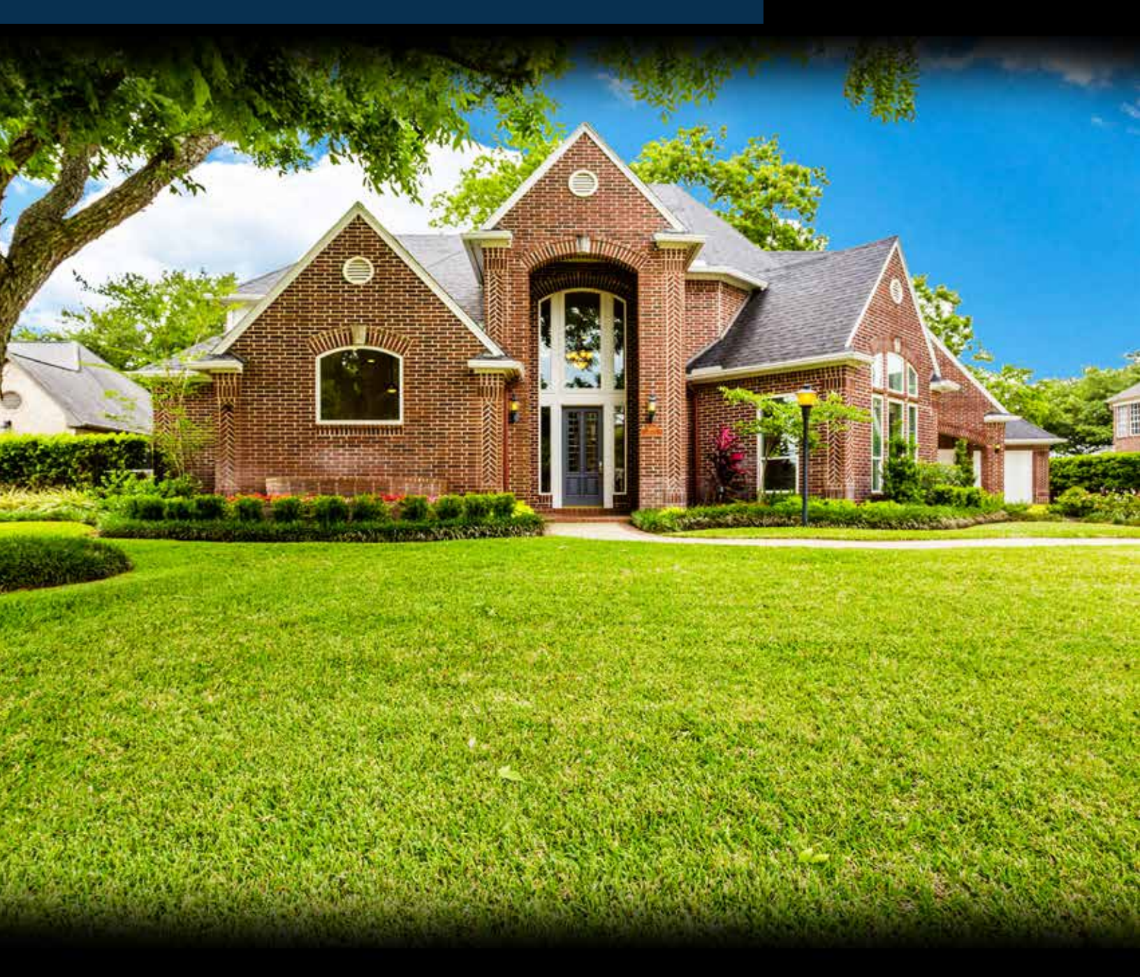
5003 Waterbeck Street • Weston Lakes