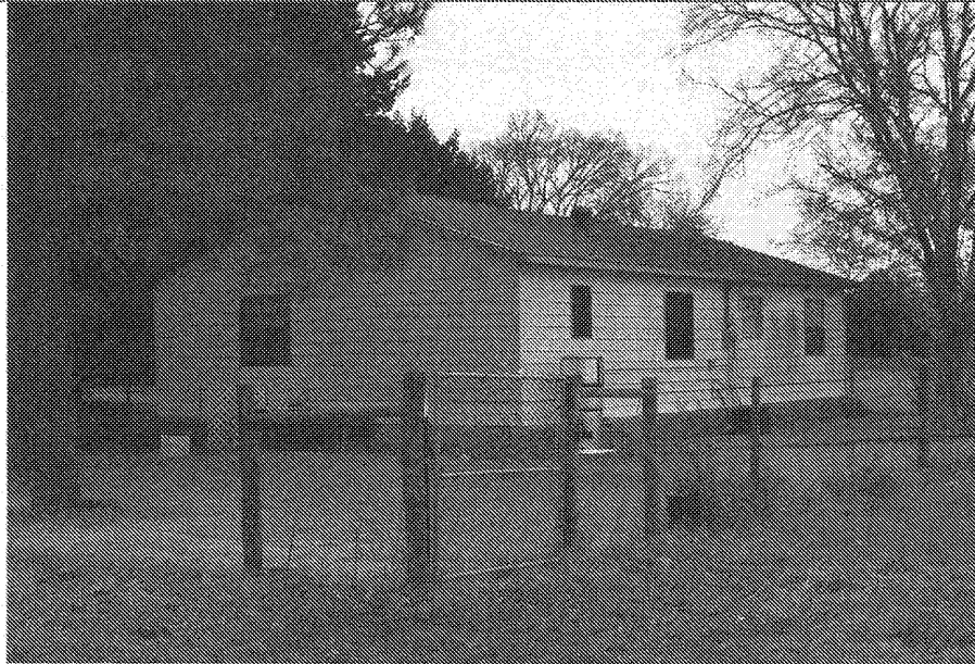
REAR AND LEFT SIDE VIEW (DATED 1-14-15)

If using the Elevation Certificate to obtain NFIP flood insurance, affix at least 2 building photographs below according to the instructions for Item A6. Identify all photographs with date taken; "Front View" and "Rear View"; and, if required, "Right Side View" and "Left Side View." When applicable, photographs must show the foundation with representative examples of the flood openings or vents, as indicated in Section A8. If submitting more photographs than will fit on this page, use the Continuation Page.