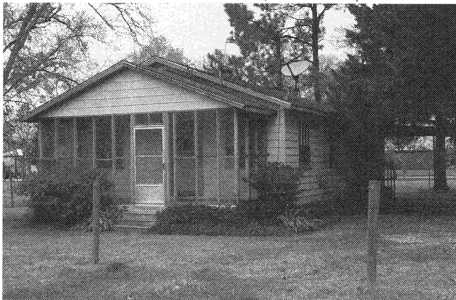
FRONT AND RIGHT SIDE VIEW (DATED 1-14-15)