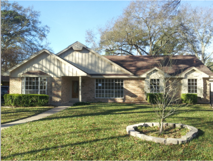
FRONT PROPERTY PICTURE 1/31/2013

If using the Elevation Certificate to obtain NFIP flood insurance, affix at least two building photographs below according to the instructions for Item A6. Identify all photographs with: date taken; "Front View" and "Rear View"; and, if required, "Right Side View" and "Left Side View." If submitting more photographs than will fit on this page, use the Continuation Page on the reverse.