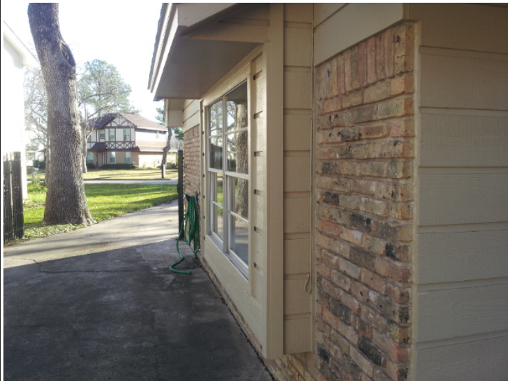
RIGHT PROPERTY PICTURE