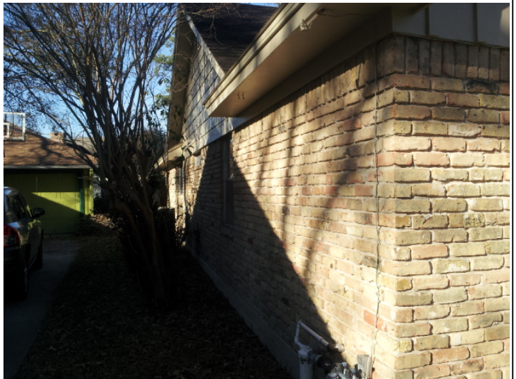
LEFT PROPERTY PICTURE