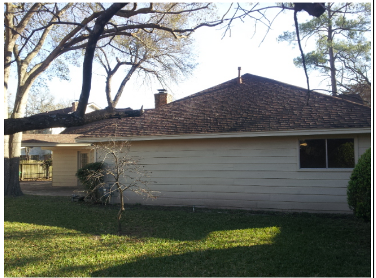
REAR PROPERTY PICTURE 1/31/2013