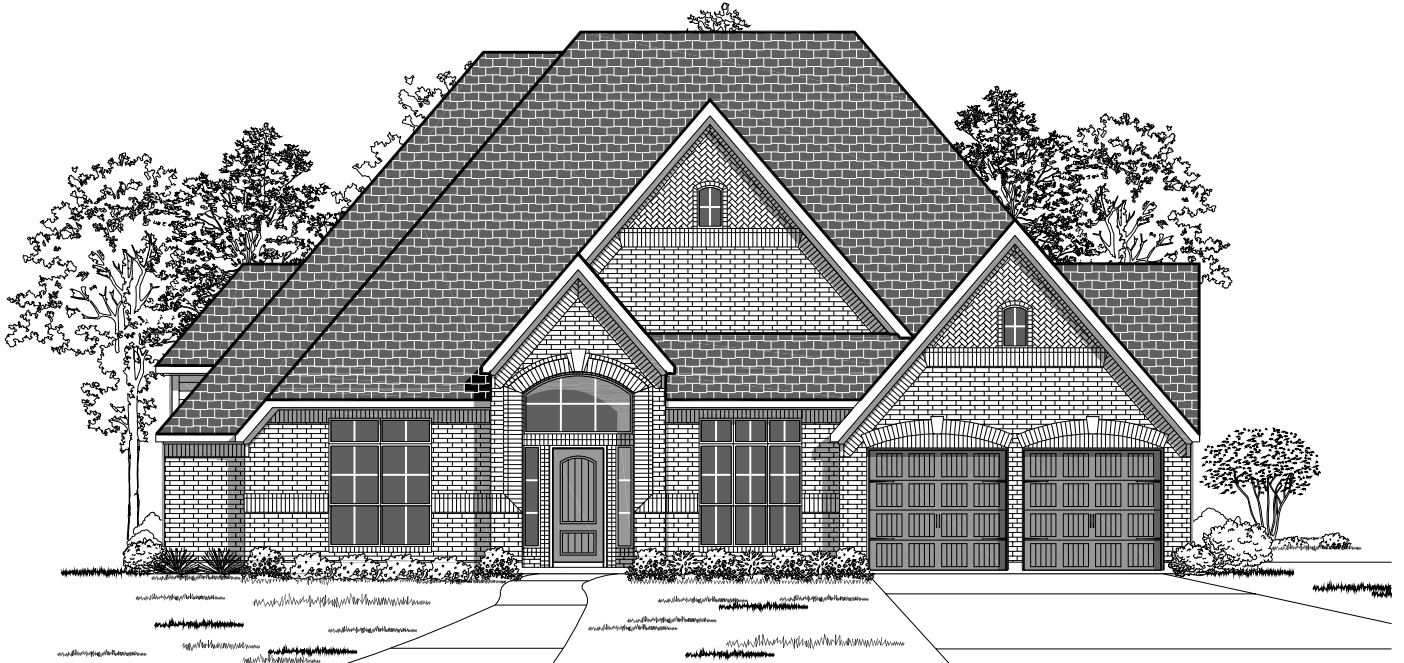
Design 3714W E-1