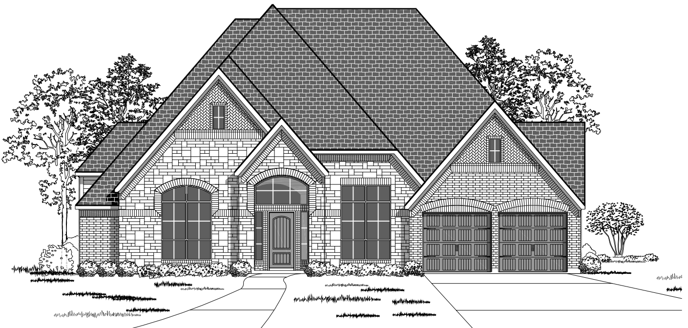
Design 3714W E-70

*See Page 3 for Details and Disclaimers. © Perry Homes, LLC 2019