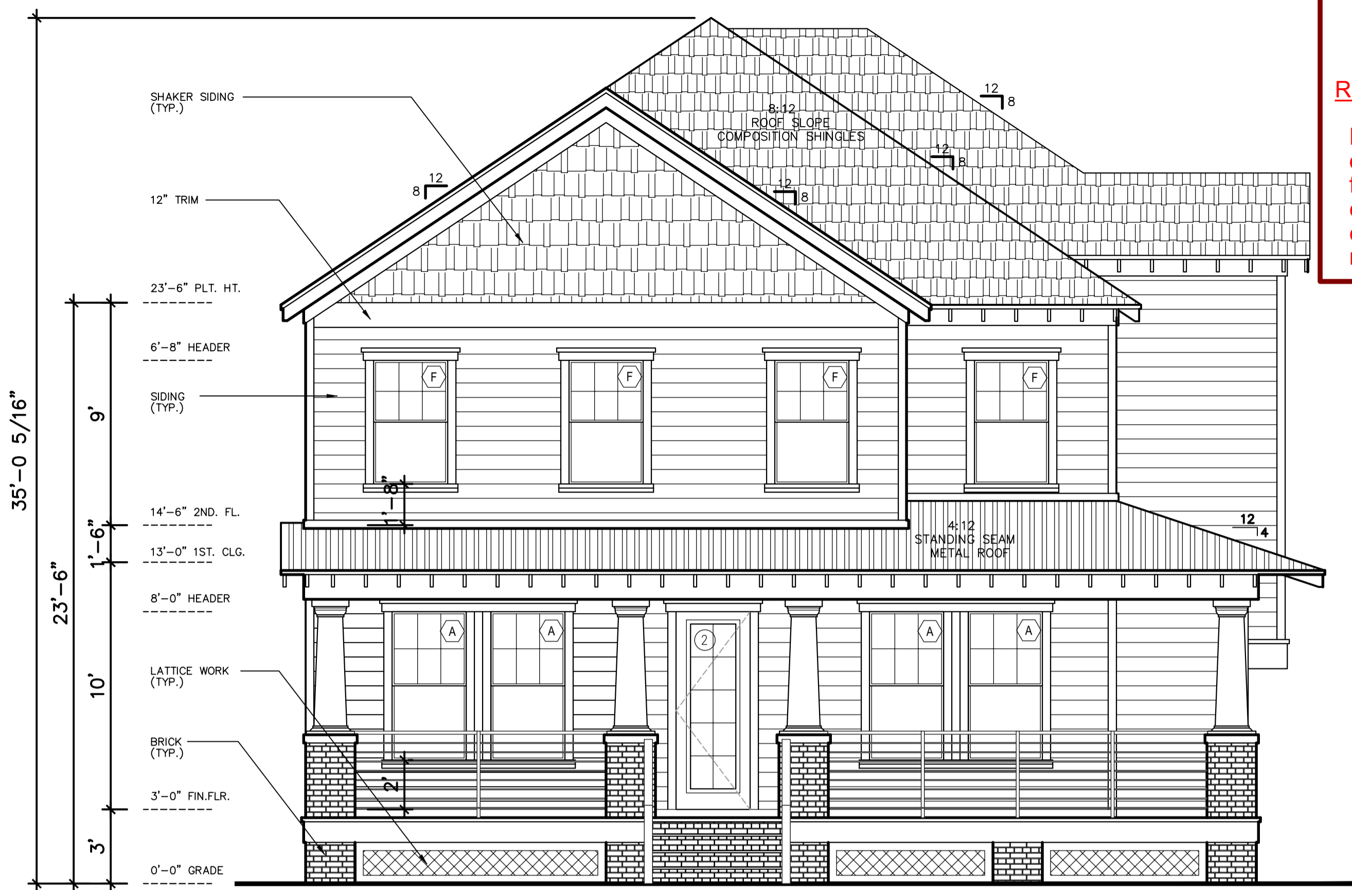
FRONT ELEVATION SCALE: 1/4" = 1'-0" SIDING 794 SQ.FT. BRICK 85 SQ.FT. LATTICE 39 SQ.FT. SHAKER 80 SQ.FT. PRIMARY EXTERIOR MATERIAL: BRICK SECONDARY EXTERIOR MATERIAL: SIDING ROOF MATERIAL: COMPOSITION SHINGLES ALL DOOR AND WINDOW ASSEMBLIES TO HAVE MATCHING SURROUNDS. HEAD HEIGHTS TAKEN FROM IMMEDIATE INTERIOR FLOOR LEVEL.