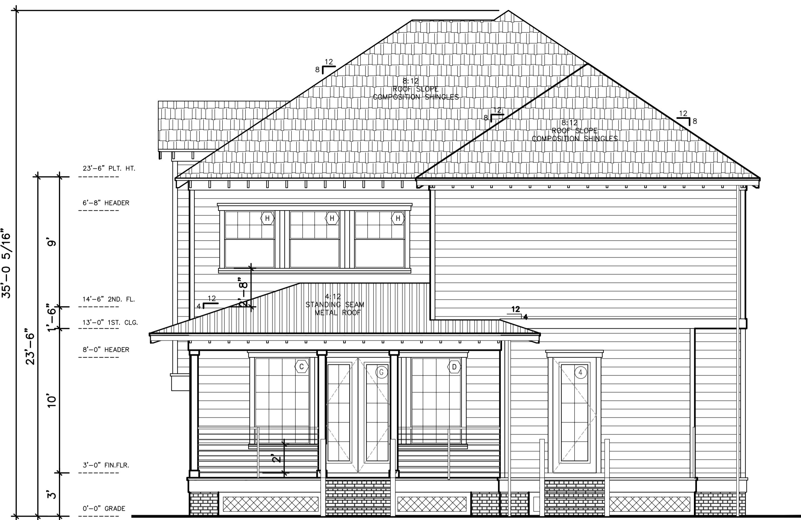
REAR ELEVATION SCALE: 1/4" = 1'-0" SIDING 785 SQ.FT. BRICK 37 SQ.FT. LATTICE 0 SHAKER 40 SQ.FT.

DATE: 12/10/19 DRN. BY CK'D BY BG BG SHEET NO: A4.0 Draft 5