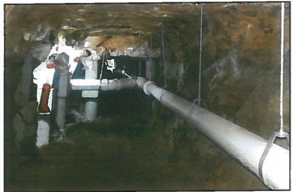
PVC PIPES DO NOT DETERIORATE