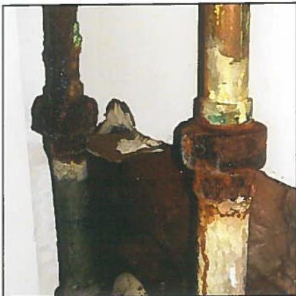
LOW PRESSURE DAMAGING LEAKS