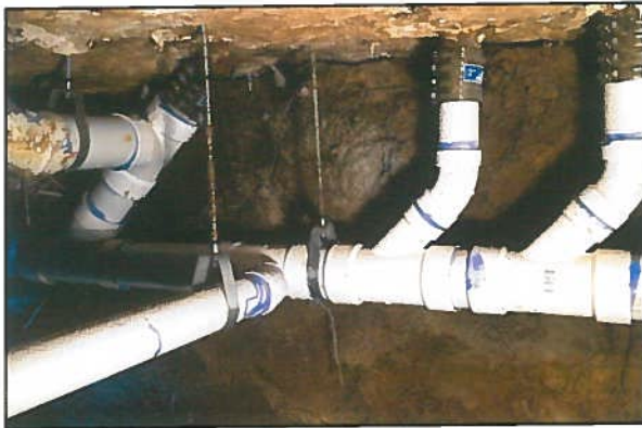
REMOVE & REPLACE CAST IRON WITH PVC