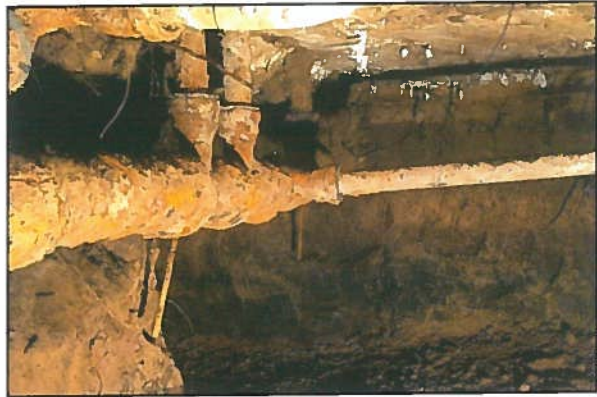
CAST IRON/ABS PIPES SEWER LINE FAILURE