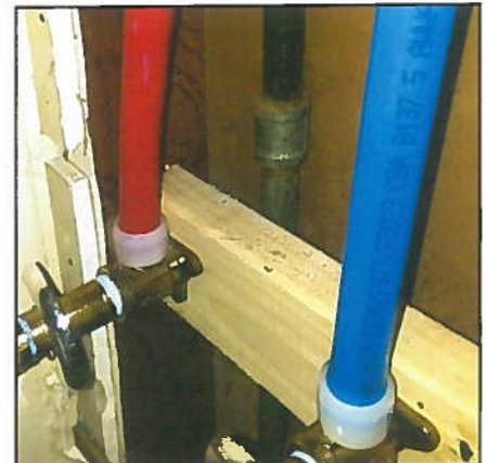
PEX PIPES RESISTANT TO FREEZE & CORROSION