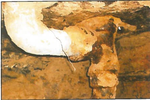
LEAKS, BREAKS, ROOTS, DIRT CLOG DRAIN LINES

Cast Iron and ABS sewer lines deteriorate, crack and corrode under the foundation. This leakage softens the dirt and erodes the soil. The slab sinks to the interior causing serious structural problems.