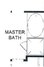
OPTIONAL MASTER BATH 60" X 42" TUB & 42" X 42" SHOWER