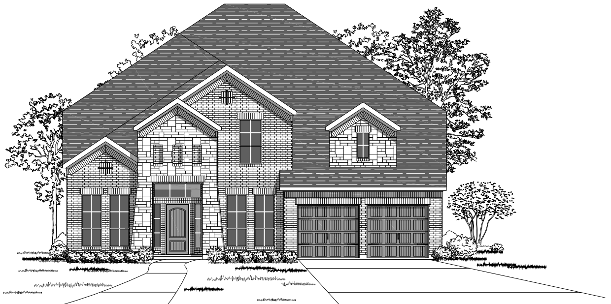
Design 4016W E-50