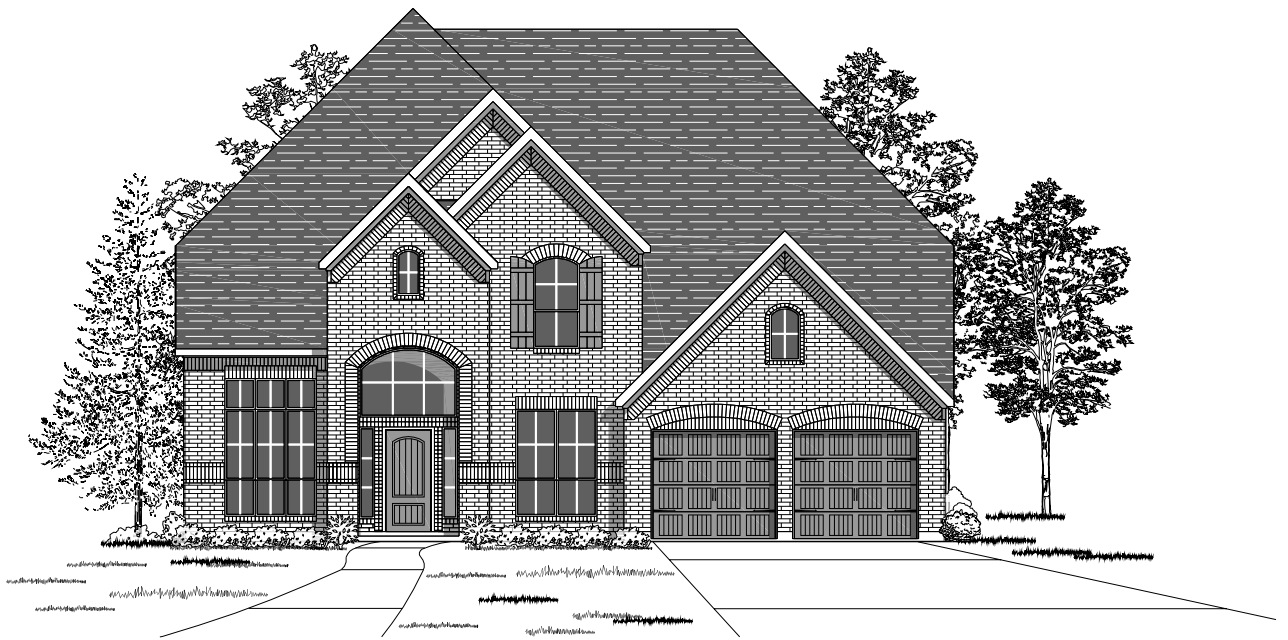
Design 4016W E-1