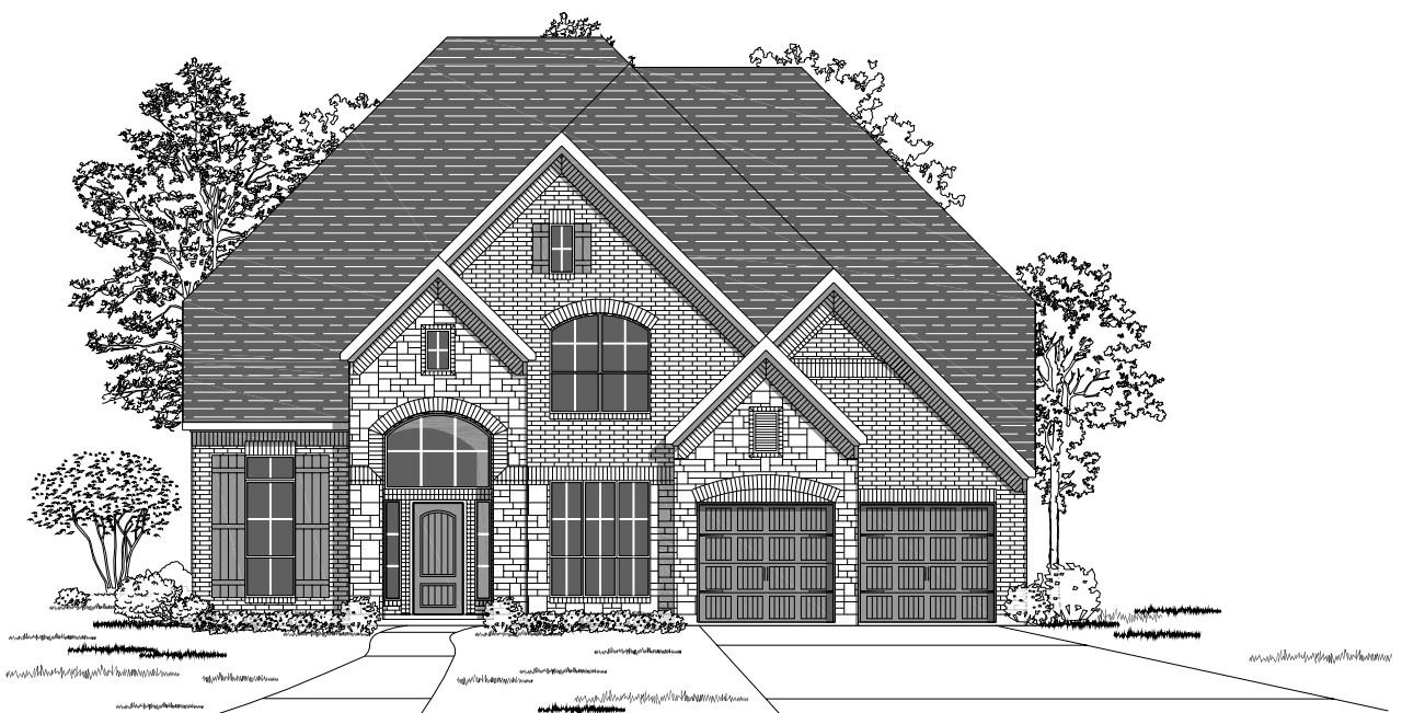
Design 4016W E-70

This design, as originally designed and prior to any changes you make, is estimated to yield approximately the number of square feet shown on page 1. All dimensions are approximate. Square footage may vary based on as-built dimensions, configurations, plan options and/or the method of calculation. Designs are not-to-scale, and are conceptual illustrations that may differ from construction plans or completed improvements. A design may depict features not available on all homesites or in all communities. Perry Homes reserves the right to make changes in plans and specifications, and to substitute material of similar quality. Prices, terms, promotions, plans, dimensions, features, options, amenities, elevations, designs, square footages, specifications, materials, and availability of homes or communities are subject to change without notice or obligation. All obligations will be governed by a written contract. This design does not constitute a commitment to build a particular floor plan or home in any given community. Some floor plans, options, and/or elevations may not be available on certain homesites or in a particular community and may require additional charges. Please check with Perry Homes to verify current offerings in the communities you are considering. This rendering is the property of Perry Homes, LLC. Any reproduction or exhibition is strictly prohibited. © Perry Homes, LLC 2018