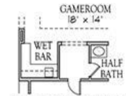
OPTIONAL WET BAR