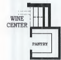
OPTIONAL WINE CENTER (BY PANTRY)