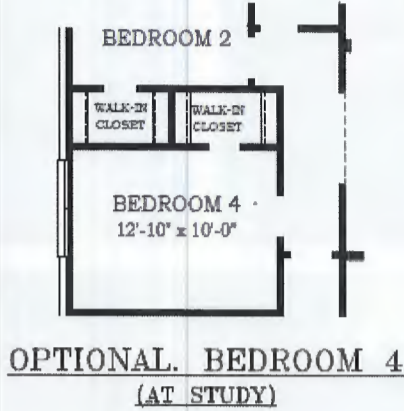
OPTIONAL BEDROOM 4 (AT STUDY)