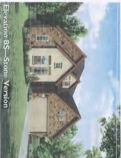
Elevation BS—Stone Version