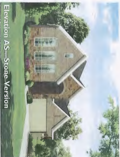
Elevation AS—Stone Version