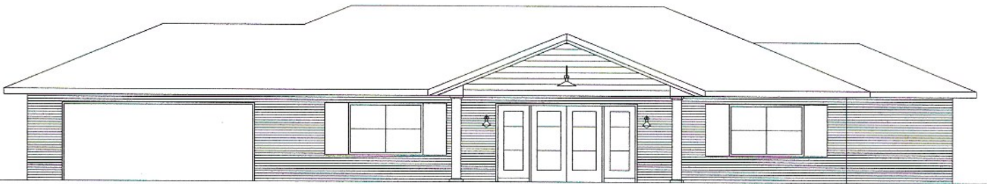
EXISTING BRICK W/ LARGER OPENING PORCH W/ CLOSED GABLE ROOF ROOF