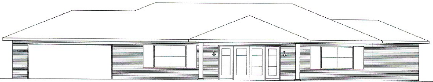
EXISTING BRICK W/ LARGER OPENING PORCH W/ HIPPED ROOF