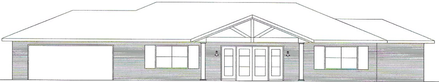
EXISTING BRICK W/ LARGER OPENING PORCH W/ OPEN GABLE ROOF