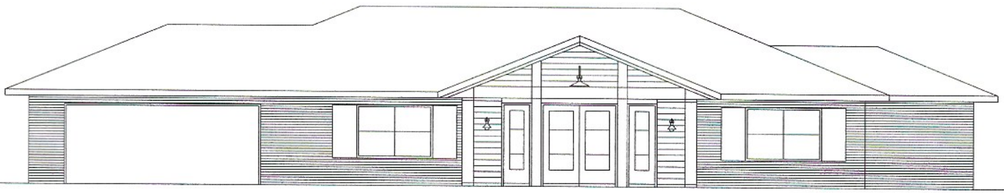
NEW WOOD + GLASS ENTRY AND PORCH W/ OPEN GABLE ROOF