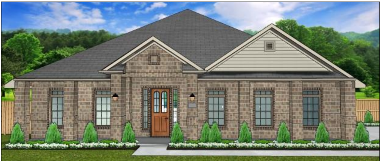
Elevation C (Optional Side Entry)