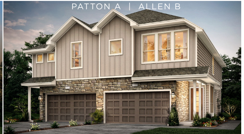
PATTON A | ALLEN B