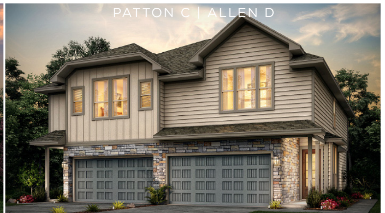
PATTON C | ALLEN D