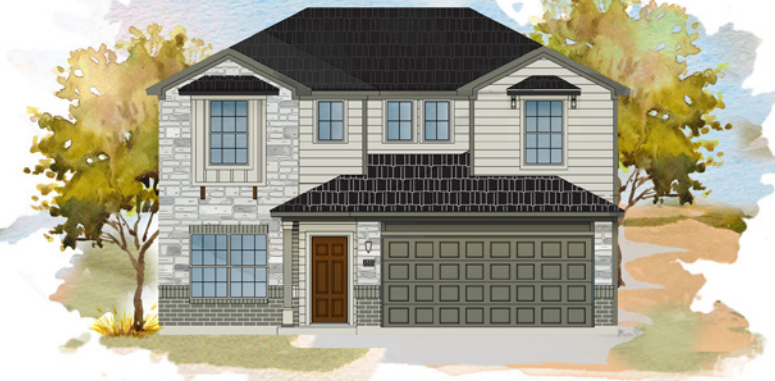
ELEVATION B Opt. Stone