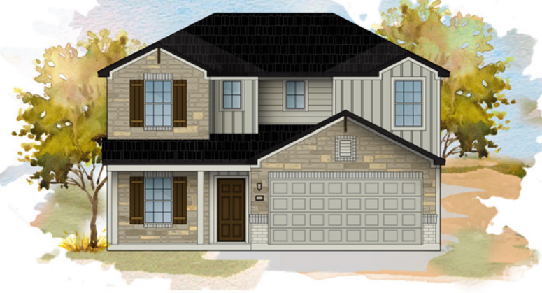
ELEVATION C Opt. Stone