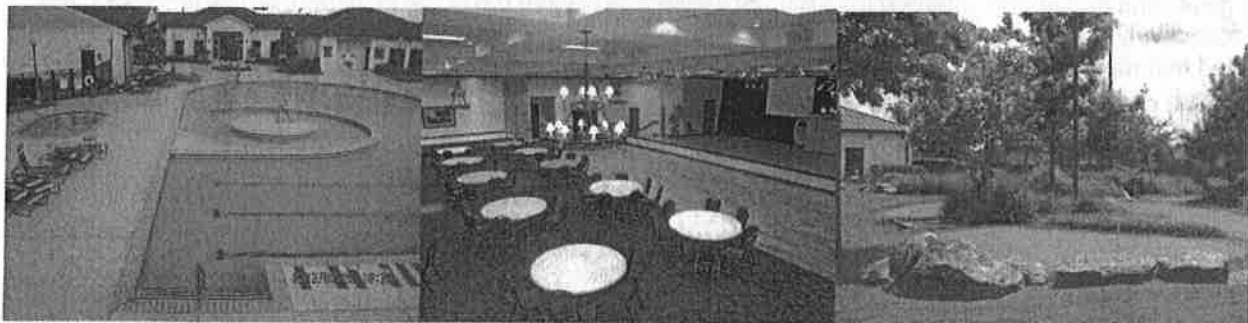
Heated swimming pool