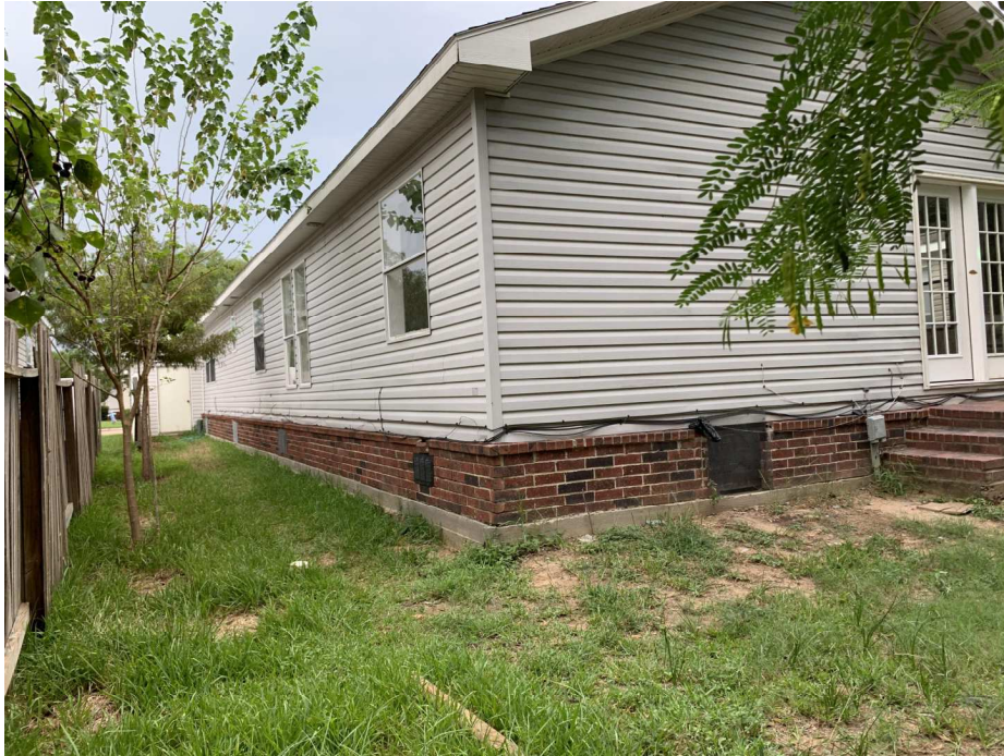
Photo Three Caption RIGHT SIDE VIEW TAKEN FROM REAR YARD (PHOTO TAKEN 9-11-2020)

If submitting more photographs than will fit on the preceding page, affix the additional photographs below. Identify all photographs with: date taken; "Front View" and "Rear View"; and, if required, "Right Side View" and "Left Side View." When applicable, photographs must show the foundation with representative examples of the flood openings or vents, as indicated in Section A8.