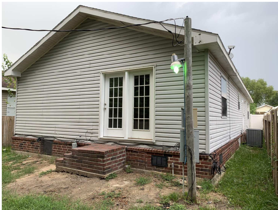
Photo Four Caption LEFT SIDE VIEW TAKEN FROM REAR YAD (PHOTO TAKEN 9-11-2020)