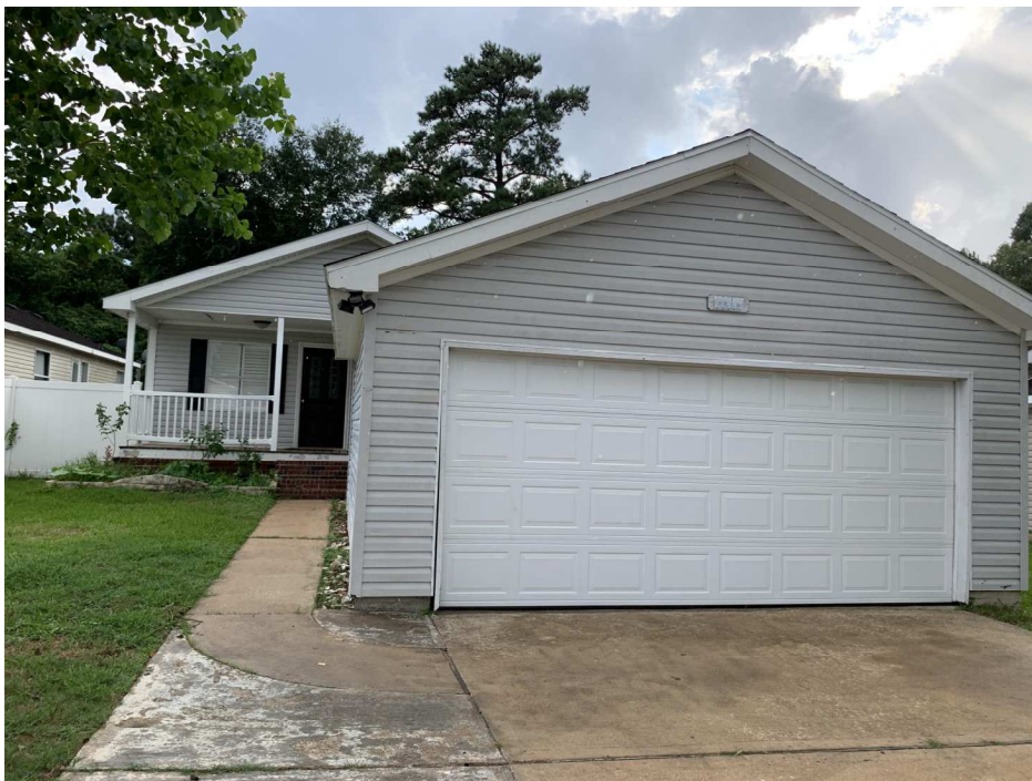
Photo One Caption FRONT VIEW (PHOTO TAKEN 9-11-2020)

If using the Elevation Certificate to obtain NFIP flood insurance, affix at least 2 building photographs below according to the instructions for Item A6. Identify all photographs with date taken; "Front View" and "Rear View"; and, if required, "Right Side View" and "Left Side View." When applicable, photographs must show the foundation with representative examples of the flood openings or vents, as indicated in Section A8. If submitting more photographs than will fit on this page, use the Continuation Page.