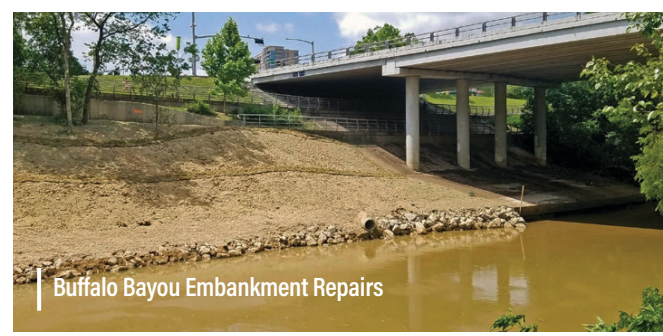
Buffalo Bayou Embankment Repairs