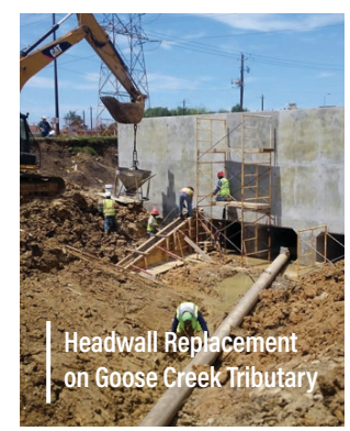
Headwall Replacement on Goose Creek Tributary