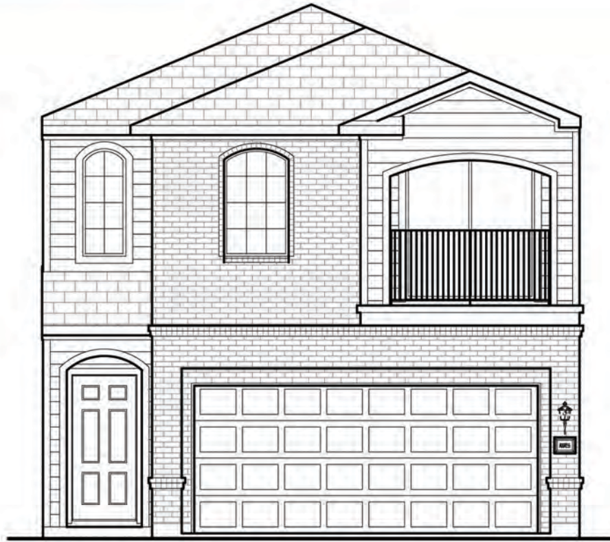
ELEVATION - A