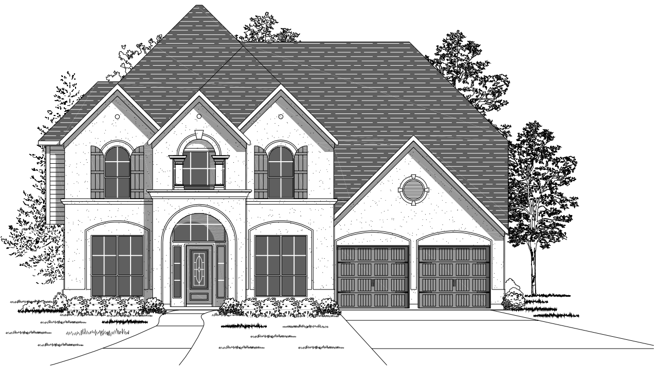
Design 3398W E-94