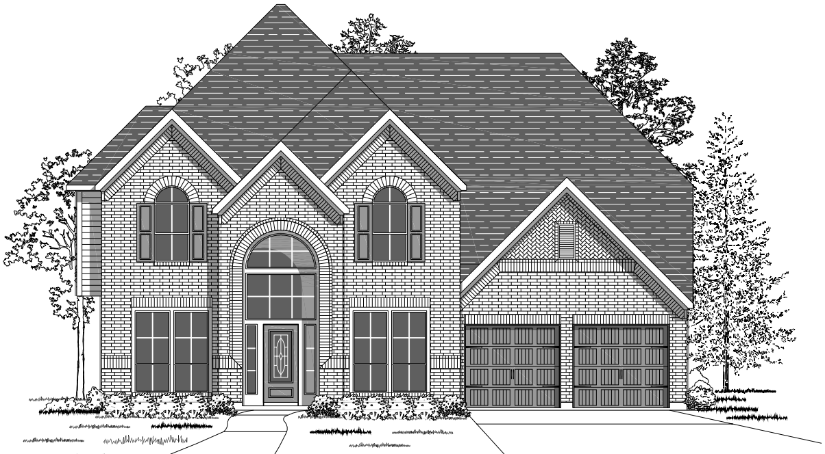
Design 3398W E-1