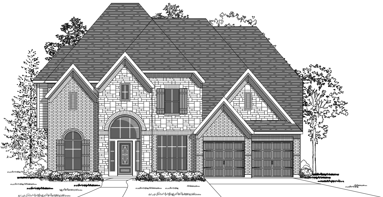
Design 3398W E-93