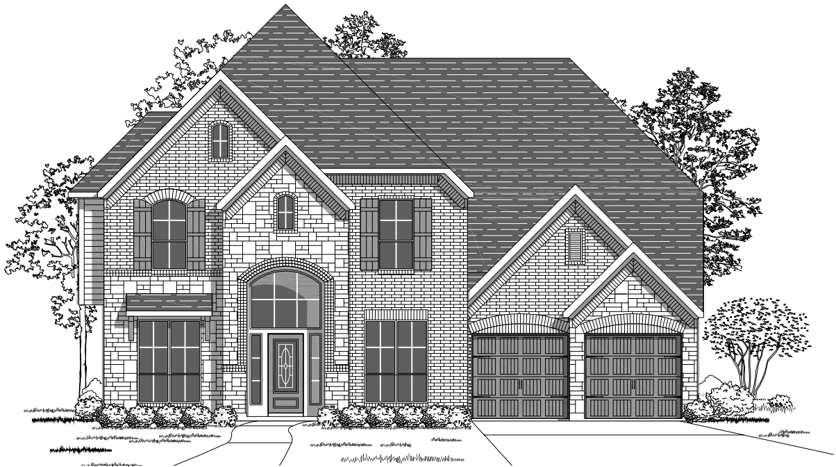
Design 3398W E-91