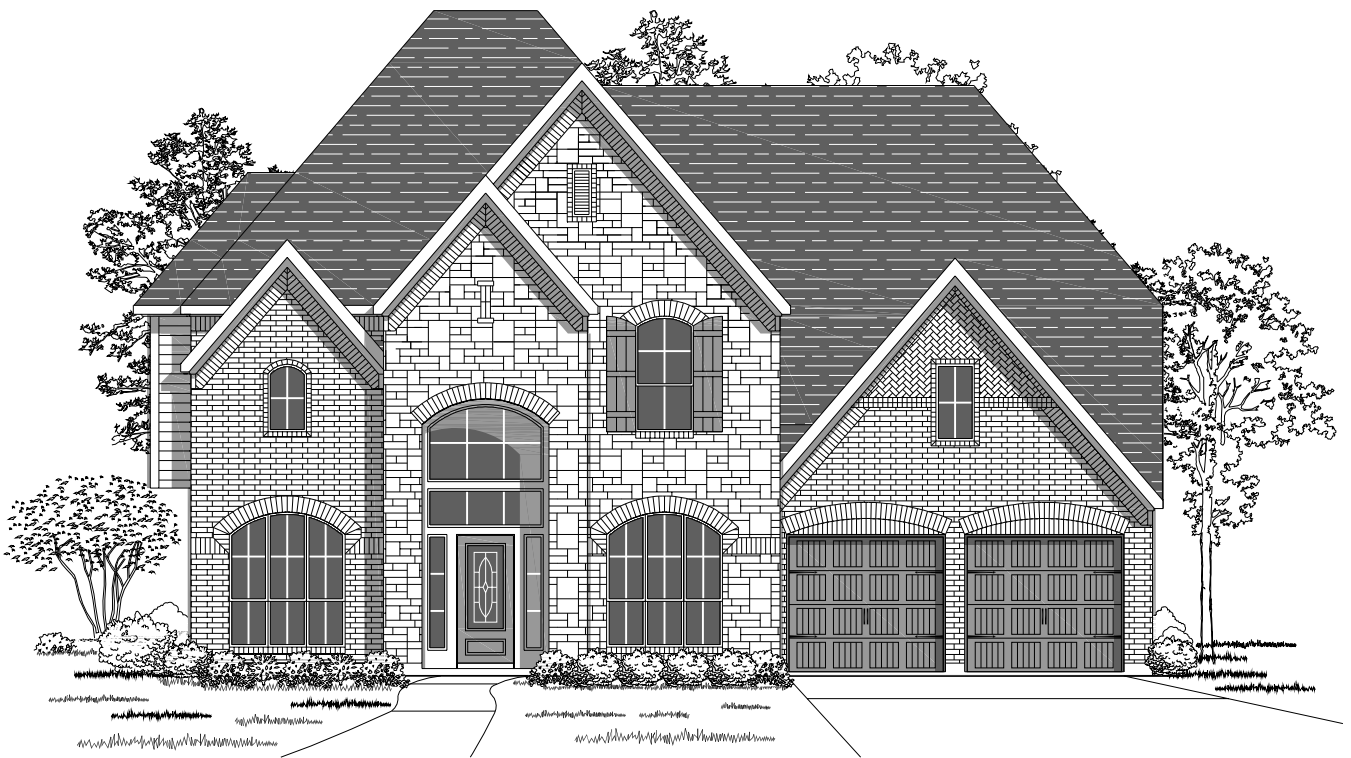
Design 3398W E-92

This design, as originally designed and prior to any changes you make, is estimated to yield approximately the number of square feet shown on page 1. All dimensions are approximate. Square footage may vary based on as-built dimensions, configurations, plan options and/or the method of calculation. Designs are not-to-scale, and are conceptual illustrations that may differ from construction plans or completed improvements. A design may depict features not available on all homesites or in all communities. Perry Homes reserves the right to make changes in plans and specifications, and to substitute material of similar quality. Prices, terms, promotions, plans, dimensions, features, options, amenities, elevations, designs, square footages, specifications, materials, and availability of homes or communities are subject to change without notice or obligation. All obligations will be governed by a written contract. This design does not constitute a commitment to build a particular floor plan or home in any given community. Some floor plans, options, and/or elevations may not be available on certain homesites or in a particular community and may require additional charges. Please check with Perry Homes to verify current offerings in the communities you are considering. This rendering is the property of Perry Homes, LLC. Any reproduction or exhibition is strictly prohibited. © Perry Homes, LLC 2014