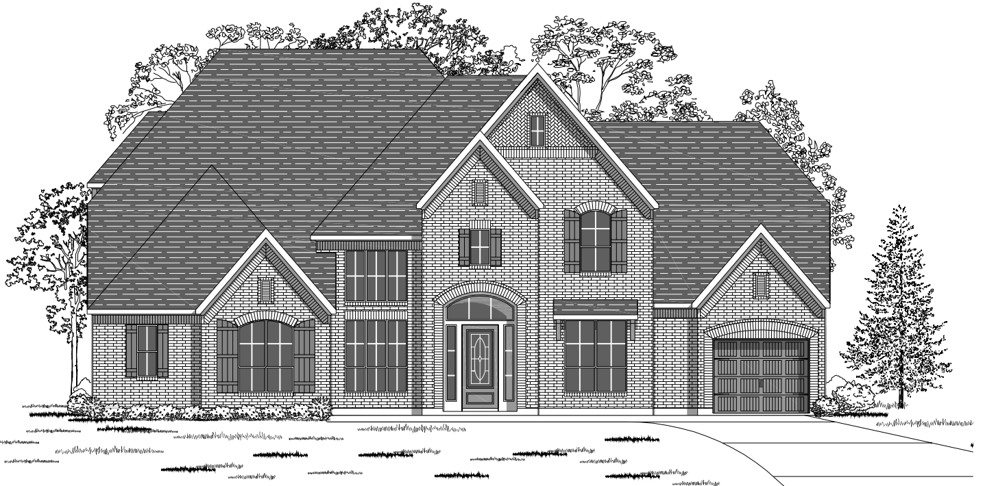
Design 4869W E-1