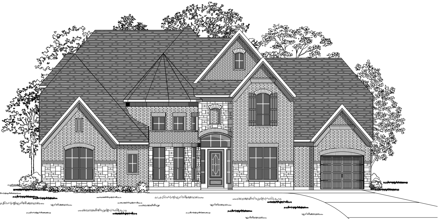
Design 4869W E-70

This design, as originally designed and prior to any changes you make, is estimated to yield approximately the number of square feet shown on page 1. All dimensions are approximate. Square footage may vary based on as-built dimensions, configurations, plan options and/or the method of calculation. Designs are not-to-scale, and are conceptual illustrations that may differ from construction plans or completed improvements. A design may depict features not available on all homesites or in all communities. Perry Homes reserves the right to make changes in plans and specifications, and to substitute material of similar quality. Prices, terms, promotions, plans, dimensions, features, options, amenities, elevations, designs, square footages, specifications, materials, and availability of homes or communities are subject to change without notice or obligation. All obligations will be governed by a written contract. This design does not constitute a commitment to build a particular floor plan or home in any given community. Some floor plans, options, and/or elevations may not be available on certain homesites or in a particular community and may require additional charges. Please check with Perry Homes to verify current offerings in the communities you are considering. This rendering is the property of Perry Homes, LLC. Any reproduction or exhibition is strictly prohibited.