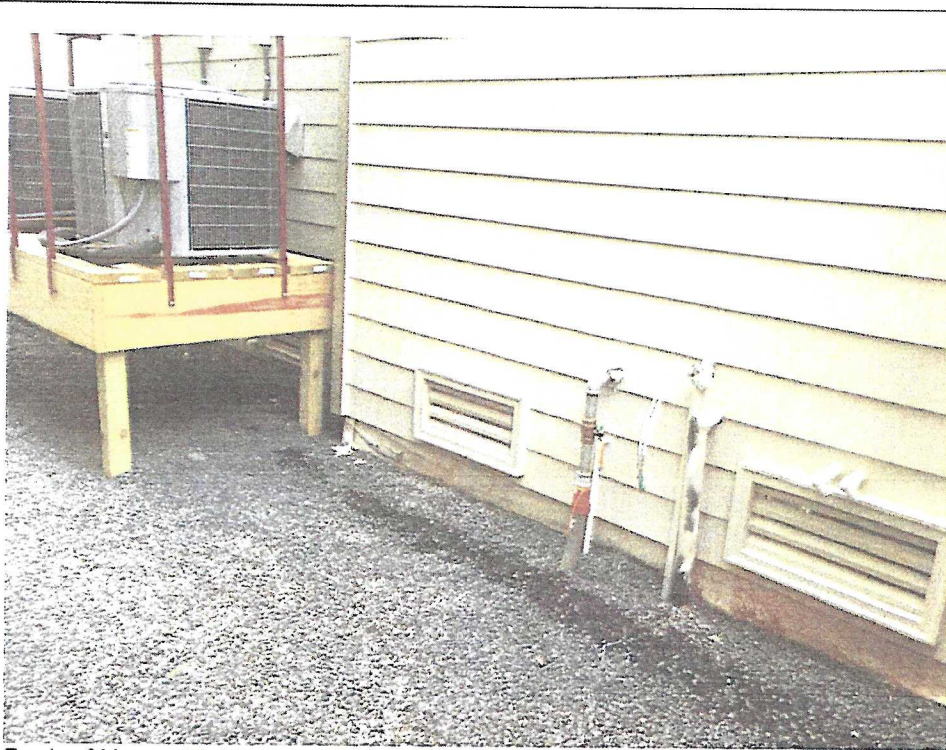
Back of Home 11-08-15

If submitting more photographs than will fit on the preceding page, affix the additional photographs below. Identify all photographs with: date taken; "Front View" and "Rear View"; and, if required, "Right Side View" and "Left Side View." When applicable, photographs must show the foundation with representative examples of the flood openings or vents, as indicated in Section A8.