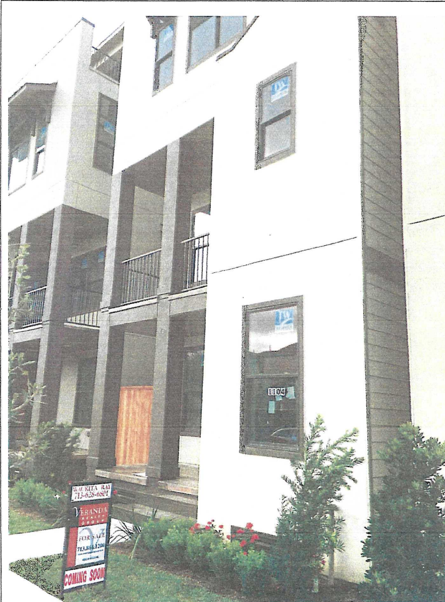
Front of Home 11-08-15

If using the Elevation Certificate to obtain NFIP flood insurance, affix at least 2 building photographs below according to the instructions for Item A6. Identify all photographs with date taken; "Front View" and "Rear View"; and, if required, "Right Side View" and "Left Side View." When applicable, photographs must show the foundation with representative examples of the flood openings or vents, as indicated in Section A8. If submitting more photographs than will fit on this page, use the Continuation Page.