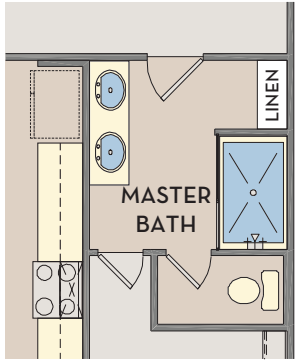
OPT. MASTER SUPER SHOWER