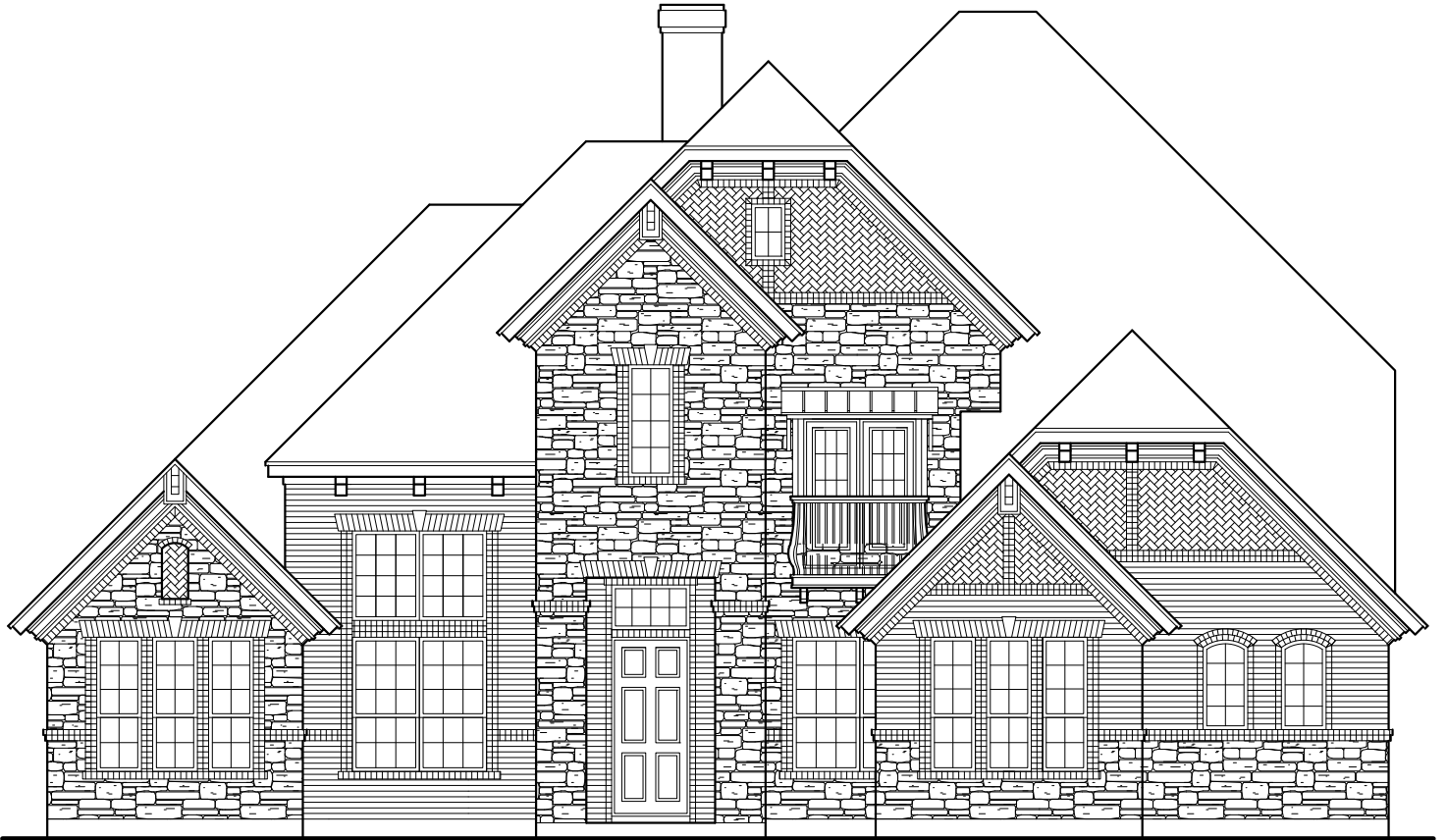
4349 ELEVATION "C"