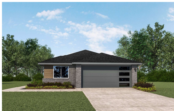
Elevation N w/ Optional Woodtone