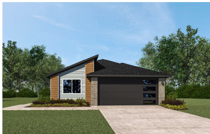
Elevation M w/ Optional Woodtone