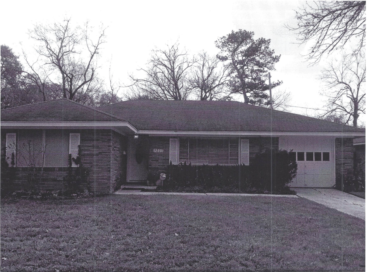
FRONT VIEW, 03-02-2012

If using the Elevation Certificate to obtain NFIP flood insurance, affix at least two building photographs below according to the instructions for Item A6. Identify all photographs with: date taken; "Front View" and "Rear View"; and, if required, "Right Side View" and "Left Side View." If submitting more photographs than will fit on this page, use the Continuation Page, following.