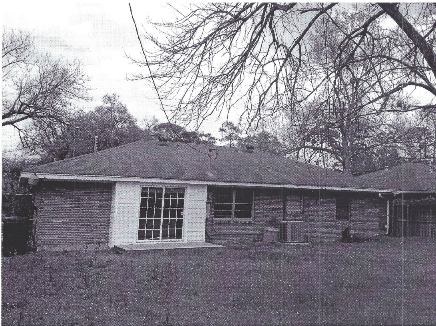
REAR VIEW, 03-02-2012

If submitting more photographs than will fit on the preceding page, affix the additional photographs below. Identify all photographs with: date taken; "Front View" and "Rear View"; and, if required, "Right Side View" and "Left Side View."