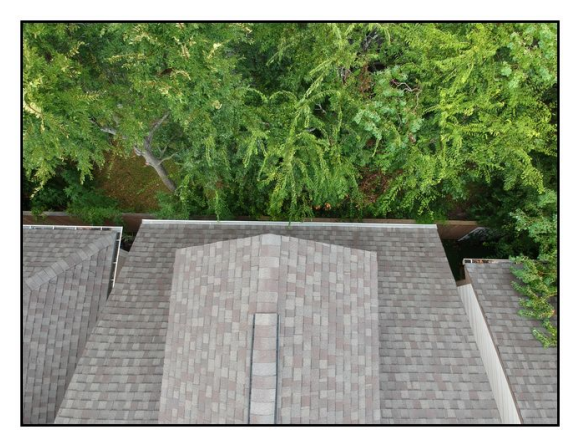
VISIBLE FLASHING: No significant deficiencies or anomalies observed at the time of inspection.

<u>Tree limbs in contact with roof can/ will damage the roof. Recommend keeping trees</u> <u>trimmed from home.</u>