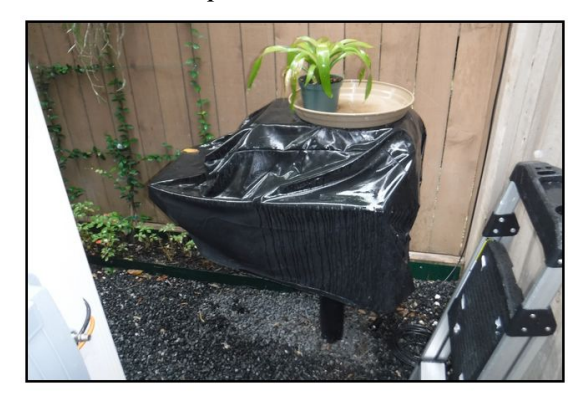
WHOLE HOME VACUUM:

OUTDOOR COOKING EQUIPMENT: Not checked/inspected.