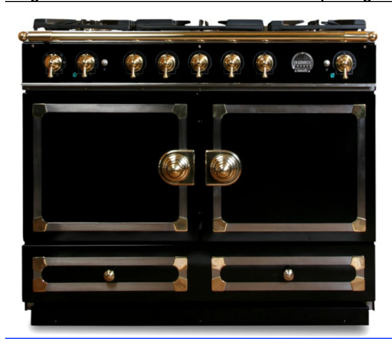
Range & Double Oven: La Cornue Cornufe 110 (black glossy with Brass Trims)