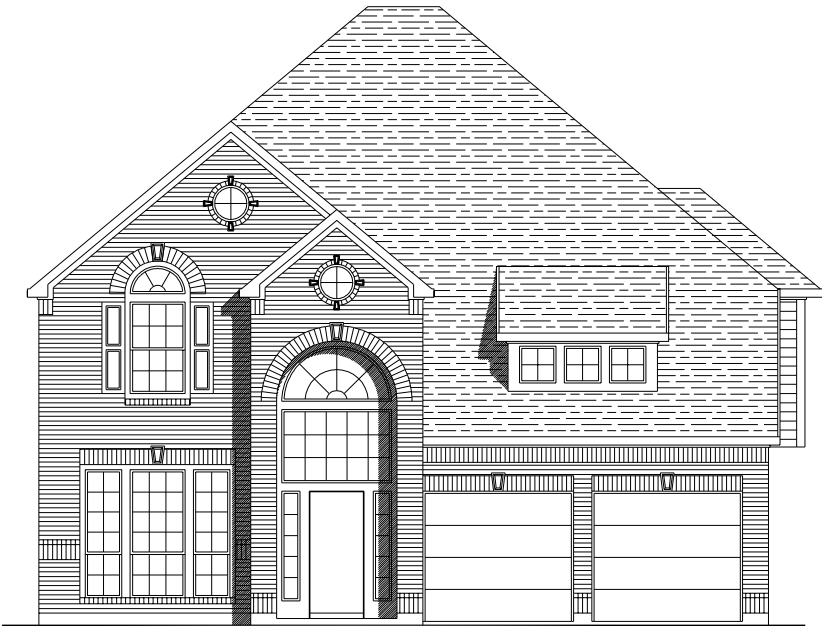
PLAN 2782W E-1

Some of the elevations shown may not be available in all communities.