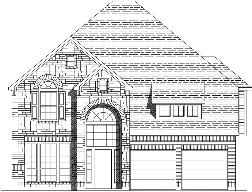
PLAN 2782W E-30