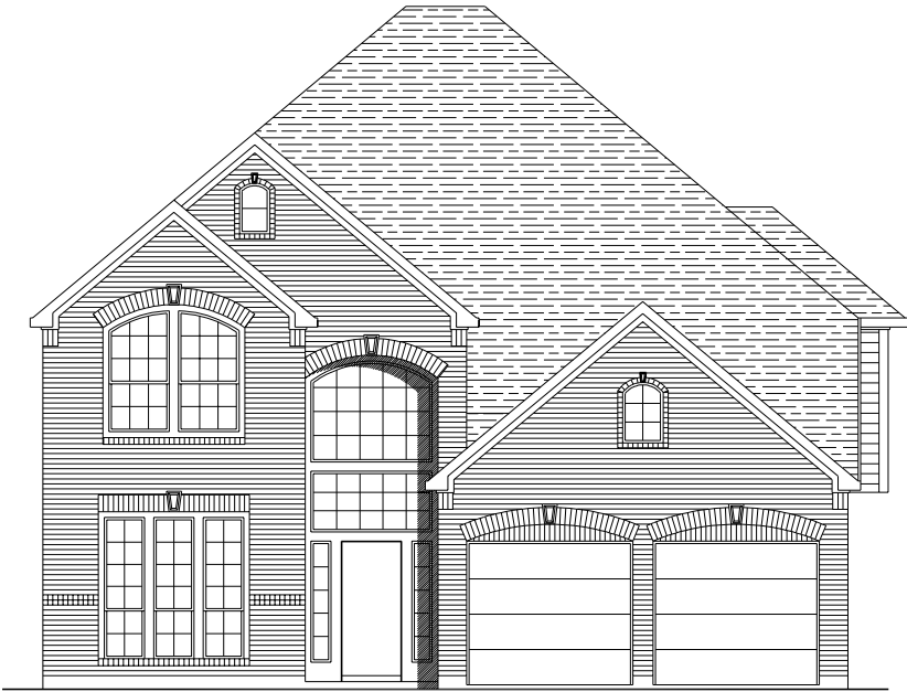
PLAN 2782W E-2