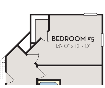
OPT. BEDROOM #5