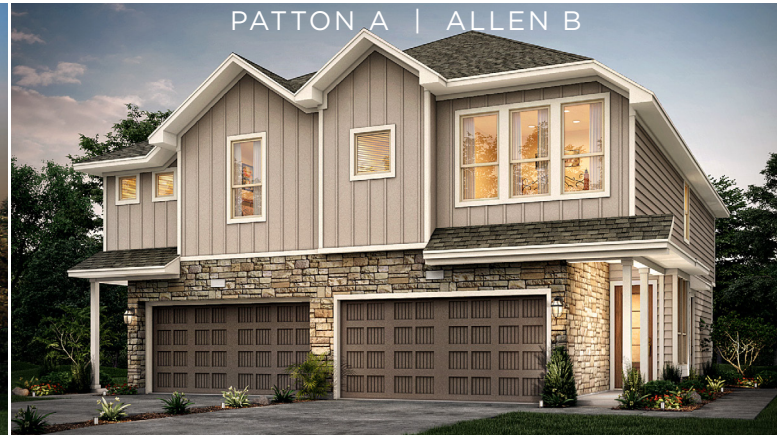
PATTON A | ALLEN B