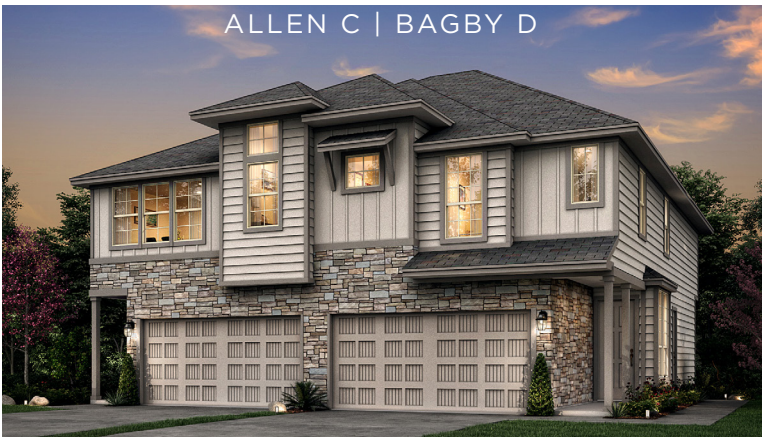
ALLEN C | BAGBY D