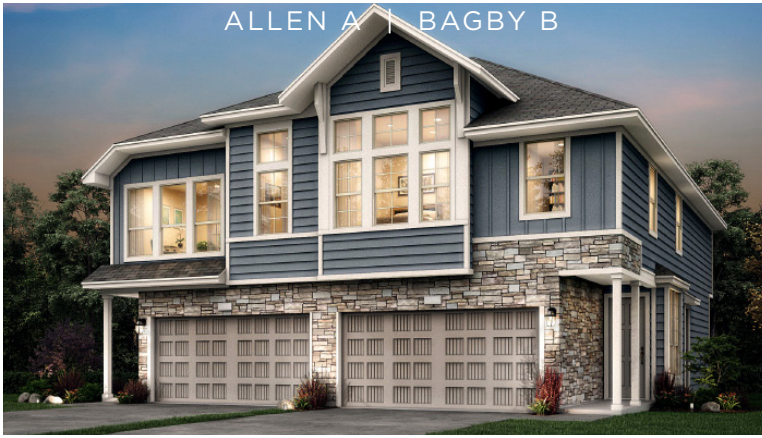
ALLEN A | BAGBY B

1,826 SQ. FT. URBAN VILLAS COLLECTION 3 BED | 2.5 BATH