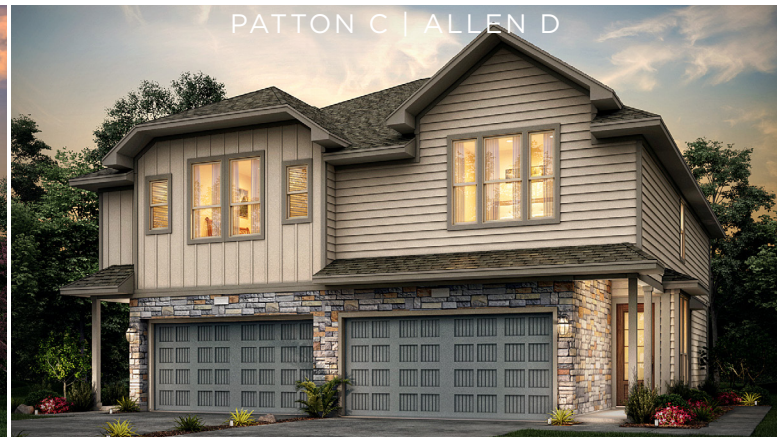
PATTON C | ALLEN D