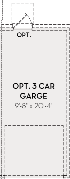
OPT. 3 CAR GARAGE 9'-8" x 20'-4"