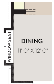
OPT. BOX WINDOW SEAT