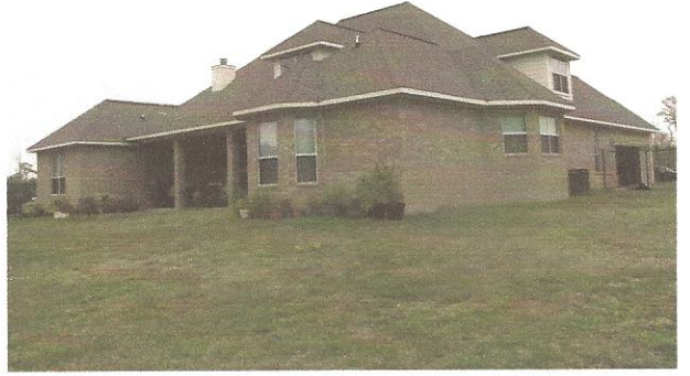
Shooting Date/Time : 2/16/2012 12:16:38 PM