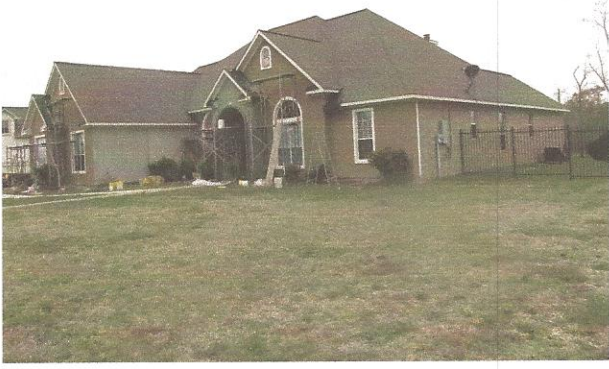
Shooting Date/Time : 2/16/2012 12:15:27 PM