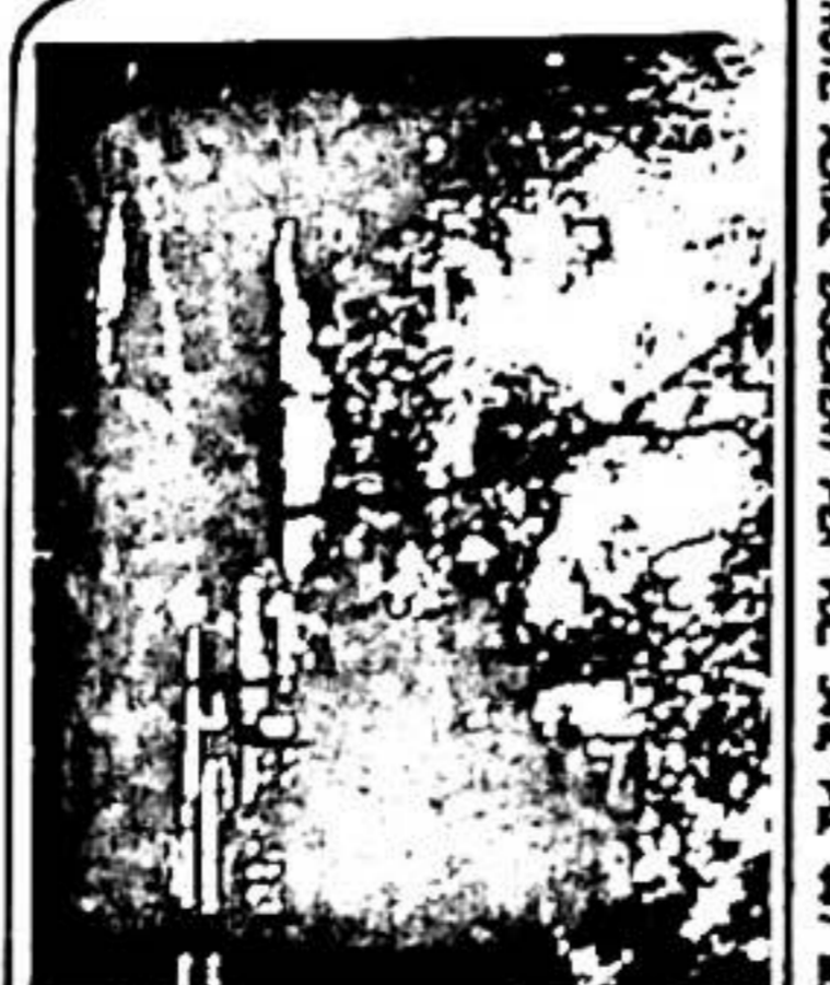
NOTE AERIAL DISCOUNT PER VOL 544 PG 441 A.C.G.R.

OF NO. 19339034542 STEWART TITLE ADDRESS: 30114 MISTY MEADOW DRIVE MAGNOLIA, TEXAS 77355 BORROWER: BRIAN FREDERICK GSELL AND KIM GEBRON LOT 19, BLOCK 1 HAZY HOLLOW ESTATES, SECTION 2 MONTGOMERY COUNTY, TEXAS ACCORDING TO THE MAP OR PLAT THEREOF RECORDED IN VOLUME 5, PAGE 531 OF THE MAP RECORDS OF MONTGOMERY COUNTY, TEXAS