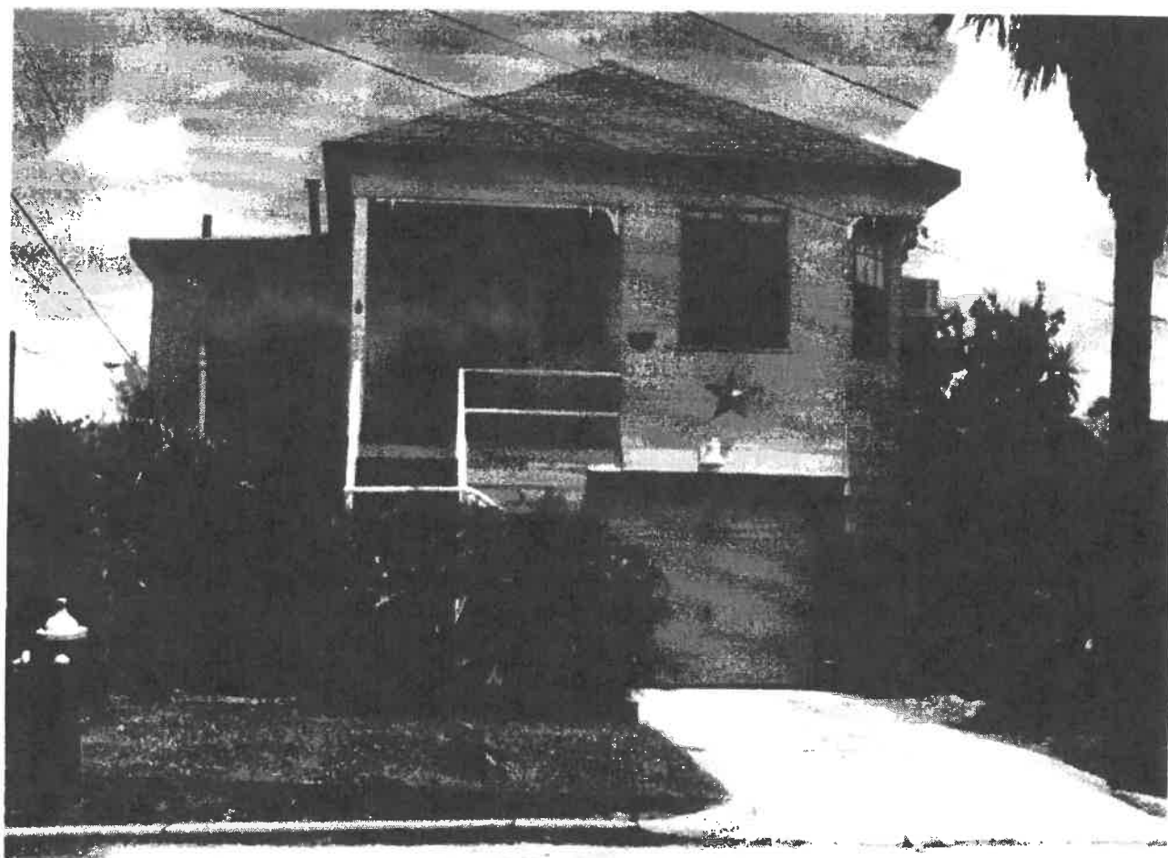
FRONT VIEW 7/26/2010

If using the Elevation Certificate to obtain NFIP flood insurance, affix at least two building photographs below according to the instructions for Item A6. Identify all photographs with: date taken; "Front View" and "Rear View"; and, if required, "Right Side View" and "Left Side View." If submitting more photographs than will fit on this page, use the Continuation Page on the reverse.