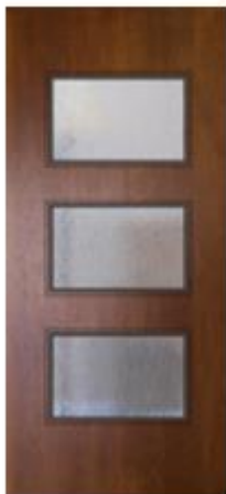
Santa Monica Mahogany