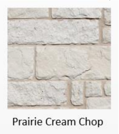
Prairie Cream Chop