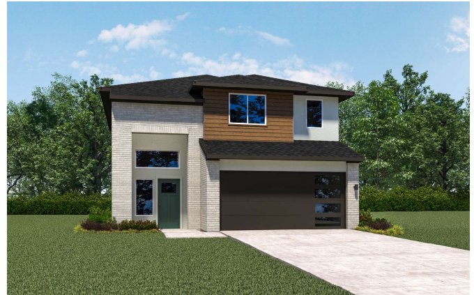
Elevation N w/ Optional Woodtone