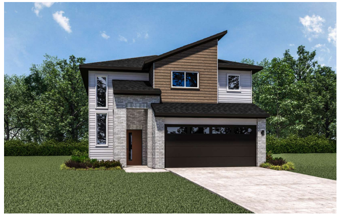
Elevation M w/ Optional Woodtone