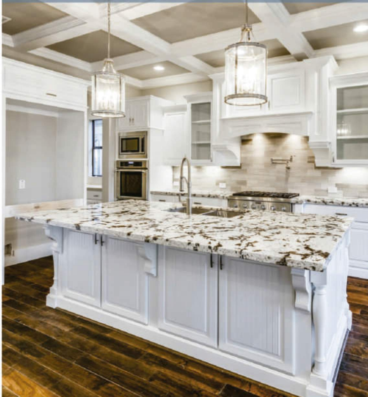
Bellaire Kitchen of Dreams