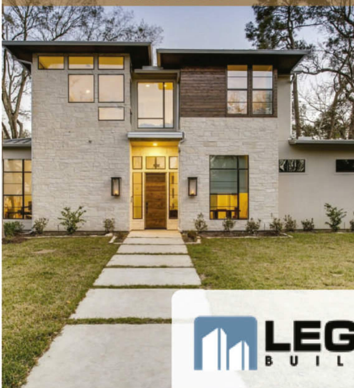
Soft Contemporary in Oak Forest