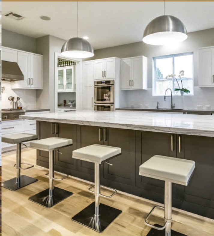
Contemporary Afton Oaks Kitchen